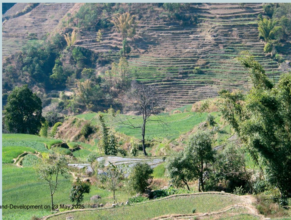
FIGURE 2 On-farm agroforestry and intercropping trials.

This environmental training program has not been limited to government bureaus. In order to foster ongoing community support and understanding, we have worked with local partners to establish community environmental education programs targeted at elementary and secondary schools, as well as training for teachers in environmental education. Village workshops and information exchanges were held regularly, and students and their families attended training sessions at local