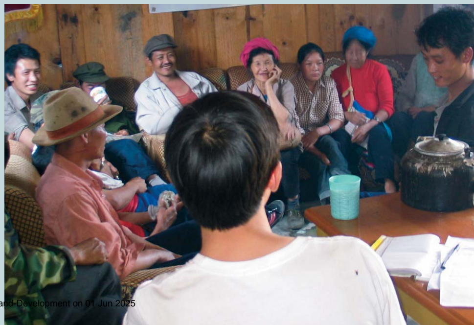
FIGURE 4 Project staff discussing establishment of a revolving drug fund with villagers.

In this process, we have been encouraging both community members and extension workers to pay attention to the potential of local knowledge. For example, villagers in Bahang hamlet were almost unanimous that winter fodder shortage was a major problem affecting cattle health and milk yields. A group began to experiment with exotic fodder grass species. Although the grasses grew well, several of the farmers rejected them. They explained that cattle health depends on maintaining ‘vital energy,’ and that although the grasses were good, they were not as restorative of ‘vital ener-