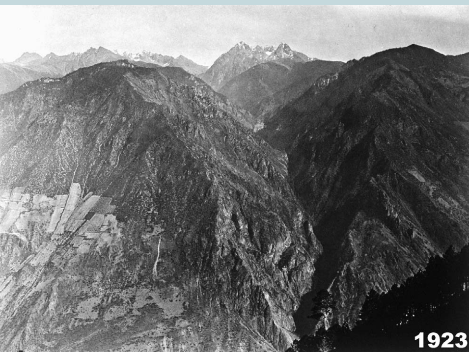
FIGURES 2A AND 2B Mountainside above Chalitong village, Deqin County. Vertical streaks on the left side of the images, faint in 1923 and obvious in 2003, are trails used to slide logs down to the village. Their presence in both images indicates that forests have been under continuous use for 80 years, yet cover has remained stable.