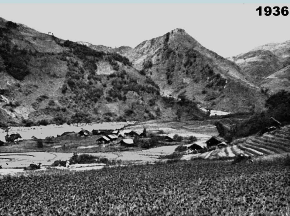
FIGURES 4A AND 4B Hillsides near Lazhidi village, Fugong County. Many crop fields and pastures in 1936 are now forested.