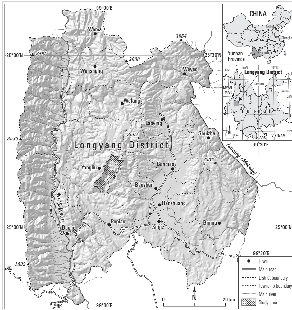
FIGURE 2 Location of Yangliu watershed, situated in Baoshan Prefecture, Yunnan, China. (Map by authors and Andreas Brodbeck)