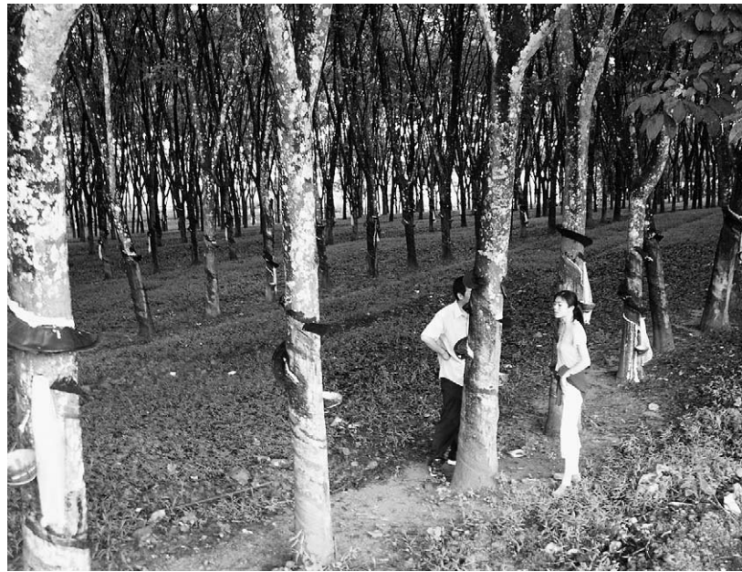
FIGURE 2 A 'legible' and 'legitimate' landscape according to the Maoist perception of nature as an environment to be completely domesticated so that it will serve mankind: rubber plantation in Menglong Township, Jinghong County, Xishuangbanna.

Shifting cultivators in Xishuangbanna such as the Lahu, the Hani and the Jinuo were thought to represent a primitive mode of production. Based on this appraisal, ideologically driven planners concluded that state rubber farms needed to be staffed by people whom they saw as the more 'educated' and 'advanced' peasants, that is, by Han Chinese farmers and 'educated youths' resettled at the 'frontier' of inland China. Those 'advanced' peasants were organized collectively in rubber plantations to become state workers representing forces of production in the socialist model. This reflected a general trend towards managed, 'legible' landscapes (Table 2).