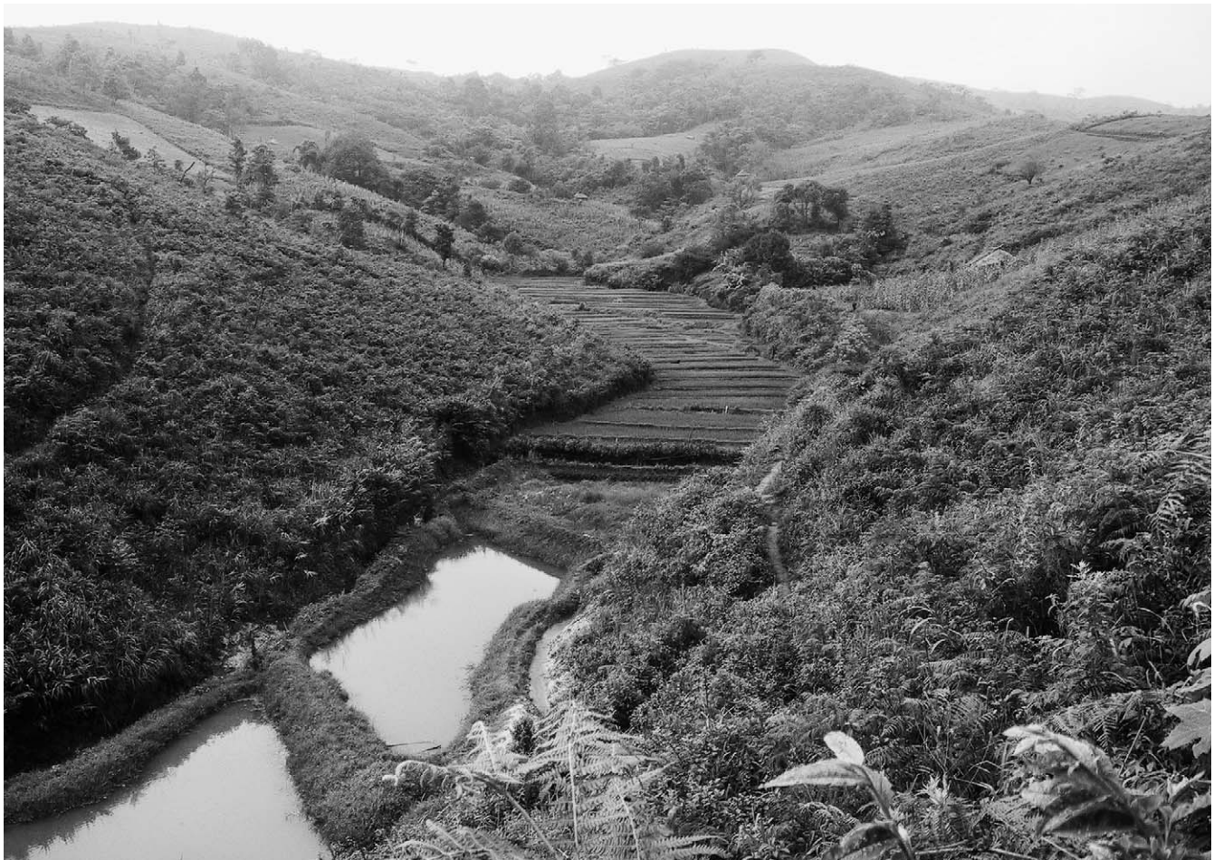
FIGURE 3 Example of the type of land use considered by the government as 'backward,' unproductive, and environmentally detrimental: swidden-fallow landscape with fishponds, paddy, rainfed crops, fruit trees, fallow, etc in Mengsong Hani Administrative Village, Menglong Township, Jinghong County, Xishuangbanna. Today, the value of such mixed management is assessed far more positively.

With economic reform in the late 1970s, disillusioned 'educated youths' working in Xishuangbanna initiated what became the 'Return to the Cities' national protest movement. Many state rubber farms nearly collapsed. Some upland Hani villages were persuaded to move to lower altitudes to provide state workers to meet the labor deficit after the departure of the 'educated youths.' In order to make them more efficient