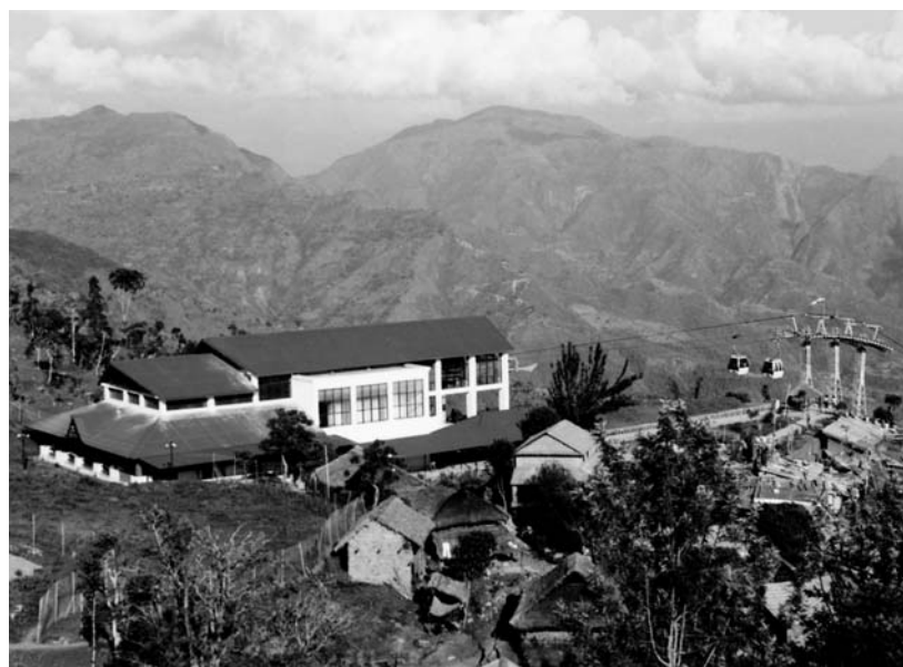
FIGURE 4 View of the upper station of the new transport system, the first of its kind in Nepal. Planning of such major tourism developments requires careful consideration of ecological, social, and cultural factors.

It remains true that the growing numbers of pilgrim tourists and the prospects for further increases attributable to pilgrim tourism's broad domestic and regional appeal point to considerable income and development potential for both national economies and local communities (Figure 4). The effects on international travel of the current unstable global and subregional security situation should alert researchers and policy makers to