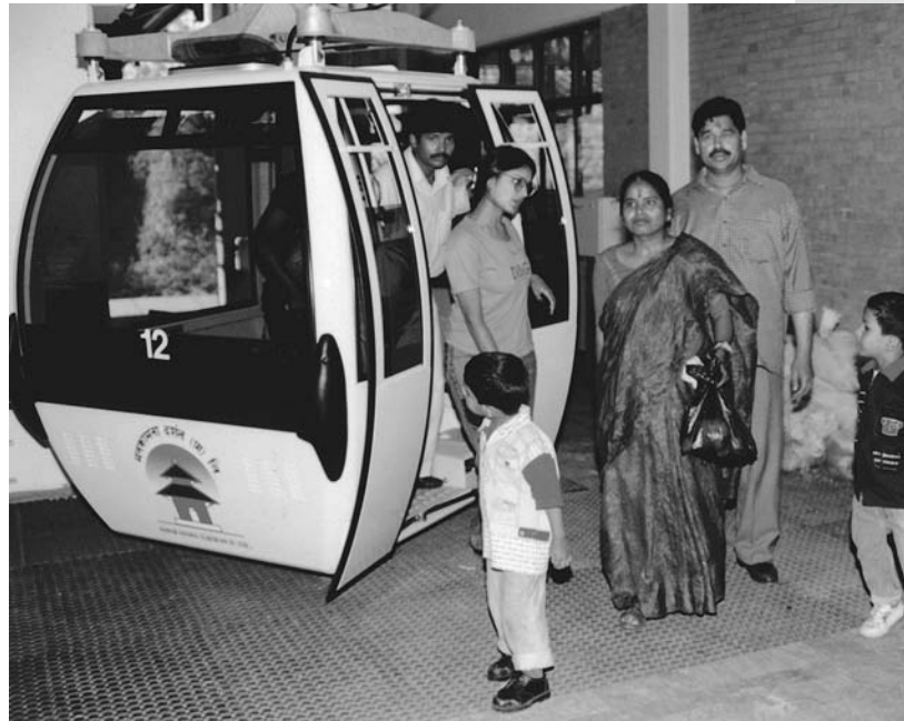
FIGURE 2 Indian pilgrims arriving by means of the new cable car. Thousands of pilgrims choose to travel this way every day instead of walking, as prescribed by their religion. Using conventional categories (“foreign or domestic tourism,” “tourism versus pilgrimage,” etc) to describe tourist activities makes it difficult to account for these changed practices.

pilgrims’ use of modern means of transportation that spearheads this cultural change (Figure 2). The changing religious and social practices of pilgrimage at the Mountain Temple of Manakamana illustrate this contention. Practically, all domestic and foreign visitors to the Manakamana Temple appear to represent the classical pilgrim in so far as they conduct their ritual affairs in a proper manner at the Goddess’s shrine. A picture of stable practices and underlying notions is radically questioned when focus is shifted from the rituals in the crowded temple courtyard and the inner shrine to the conscious motivations and the whole process of the pilgrimage, as illustrated below by our qualitative study.