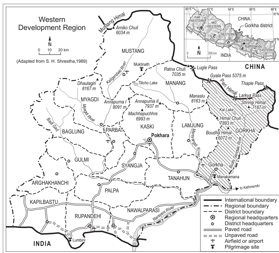
FIGURE 1 Location of Gorkha District and Manakamana. (Map by Andreas Brodbeck based on Shrestha 1989)