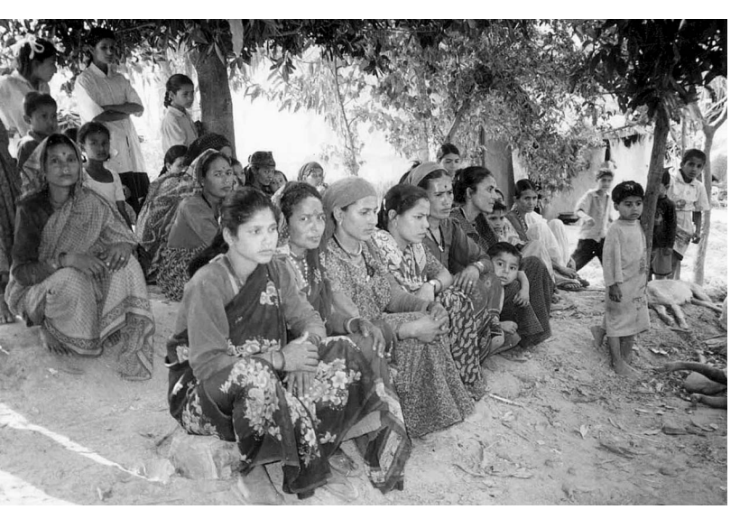
FIGURE 2 Women of the Brahmin and Chhetri castes in Pawoti village, Dolakha District, discuss a dispute over a drinking water source in order to settle the conflict between two communities informally.

politicians use FUGs as a platform for political gain. Conflict between the Federation of Forest Users and the Forest Department became severe when the government took over some of the authority and responsibility granted by the Forest Act to the users of community forests.