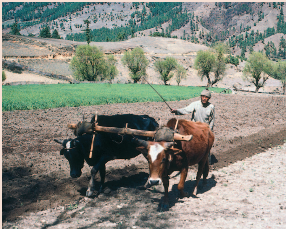
FIGURE 2 Using bullocks for planting potatoes.

Potato growers use either tractors or draft bullocks for tillage work while all other cultural practices are carried out manually. Potato cultivation is thus relatively labor intensive, requiring repeated weeding and earthing-up operations. As increased labor costs reduce potential profits, animal power for mechanized planting, weeding and earthing up was introduced in the late 1970s. Simple equipment from Switzerland was first introduced in 1975. Initial attempts to introduce such equipment with horses failed because farmers were not familiar with horses as draft animals, and the equipment produced in Bhutan was too expensive. Subsequently, farmer-driven