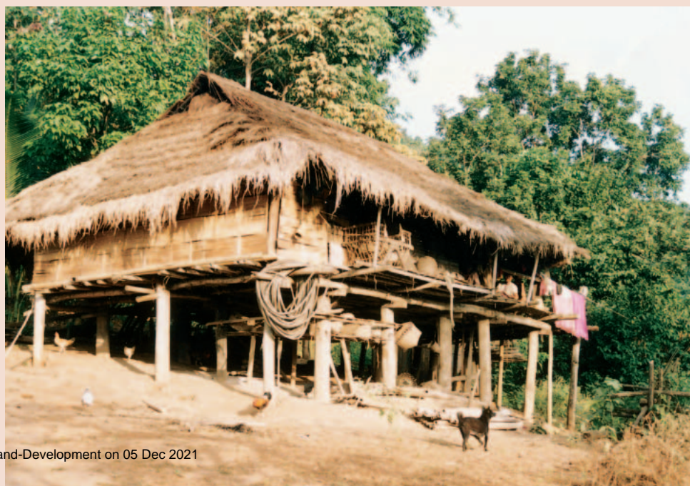
FIGURE 1 A traditional Karen house, Pae Por Highland Development Project.

Both projects aimed to raise the living standards of hill tribe populations by “improving socioeconomic position and self-reliance and progressive integration into the mainstream of Thai society,” as they declared in their project documents. Pae Por Highland Development Project (HDP) was executed by the Department of Local Administration (DOLA) and managed by the 2 District Officers into whose jurisdictions the project fell. At the field level, implementation was centered on 15 “key villages,” each staffed with a 3-person team consisting of a non-formal education