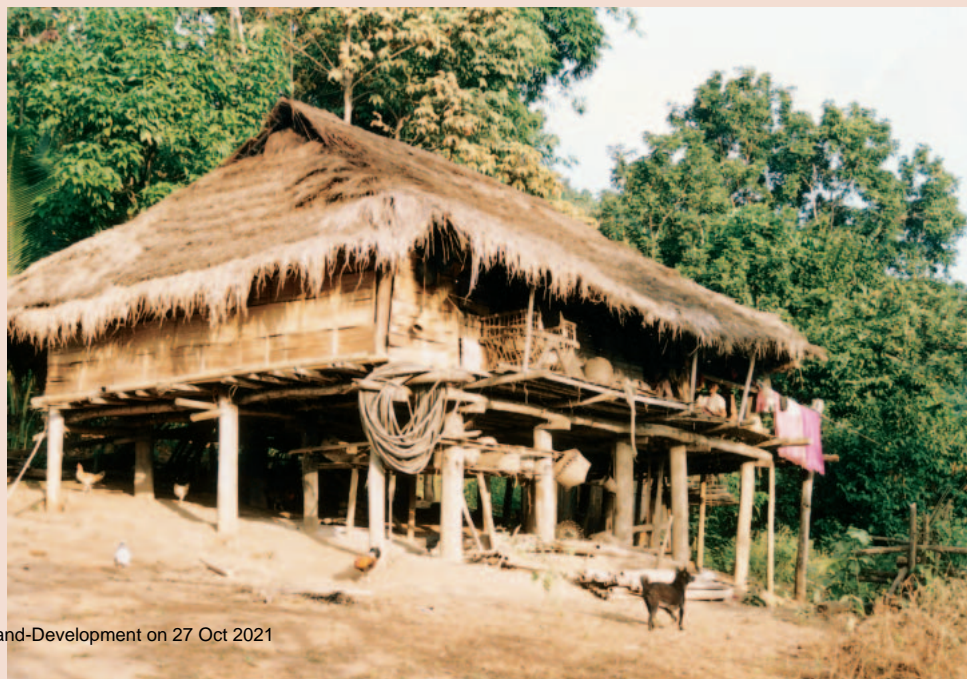
FIGURE 1 A traditional Karen house, Pae Por Highland Development Project.

Both projects aimed to raise the living standards of hill tribe populations by “improving socioeconomic position and self-reliance and progressive integration into the mainstream of Thai society,” as they declared in their project documents. Pae Por Highland Development Project (HDP) was executed by the Department of Local Administration (DOLA) and managed by the 2 District Officers into whose jurisdictions the project fell. At the field level, implementation was centered on 15 “key villages,” each staffed with a 3-person team consisting of a non-formal education