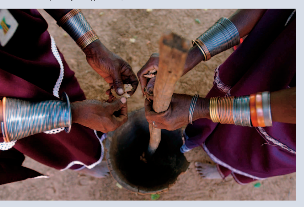
FIGURE 5 Women and men farmers have an enormous wealth of knowledge about how to treat their animals with medicine made of local plants. Pieces of mkunde kunde bark are pounded into a powder and mixed with water to cure animals of infestation with worms.

"We hope the next generation will integrate the best of the modern with the best of tradition." (Masaai herder)