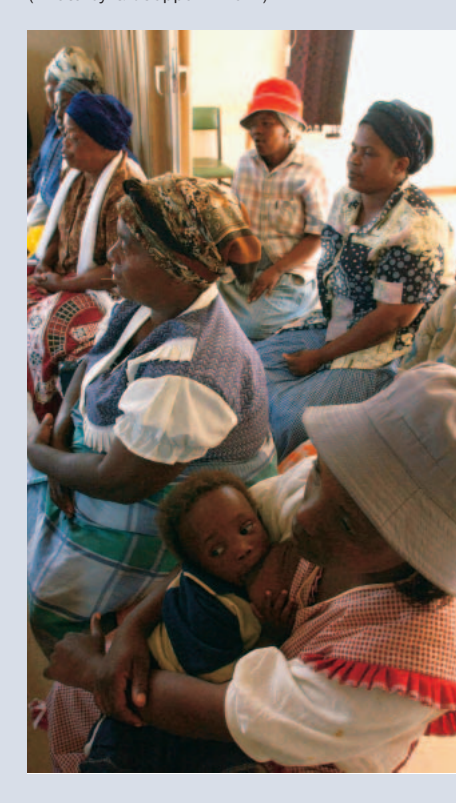
FIGURE 4 Women participating in a workshop discuss local seed varieties.

Due to workshops and intensive collaboration between many national partner institutions, an increasing interest in local knowledge was observed in Tanzania. Based on a stakeholder workshop, several institutions—the Commission for Science and Technology (COSTECH), the Tanzania Food and Nutrition Centre (TFNC), the National Environment Management Commission (NEMC), the University of Dar es Salaam, and the National Institute of Medical Research (NIMR)—formed a