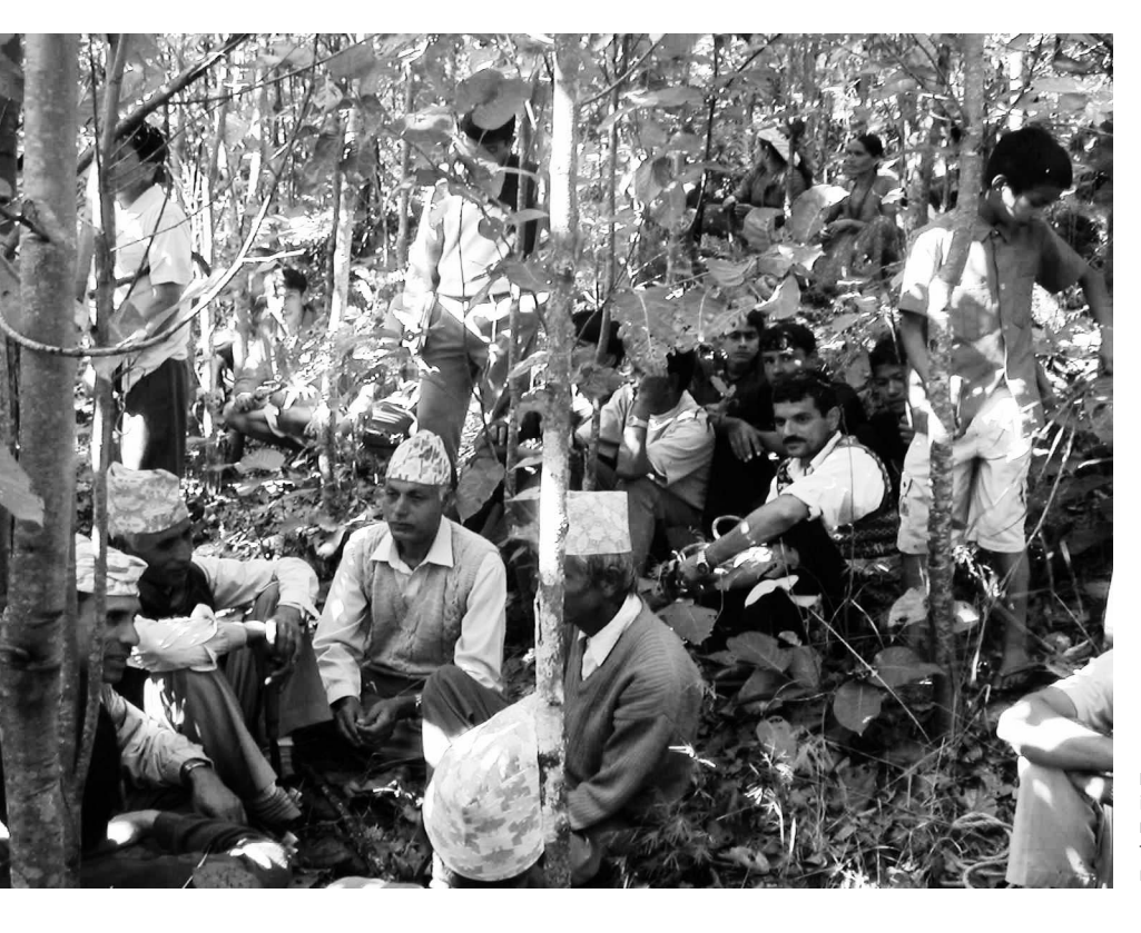
FIGURE 3 Bharkhore CFUG holds its general assembly inside a simple coppice demonstration plot; the members are discussing the possibility of catering to fuelwood demand and scaling up their management regime in the forest.