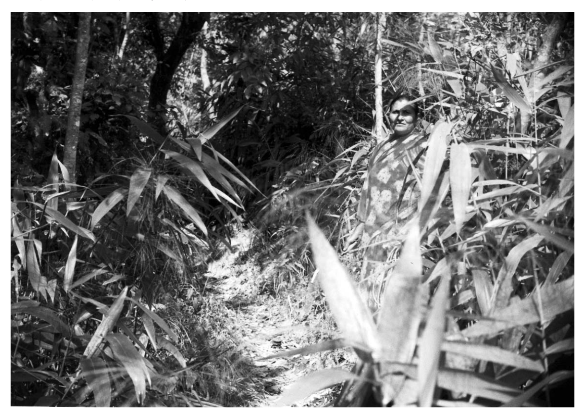
FIGURE 2 The Malati forest has multiple functions, thanks to its under-canopy layer where grass grows abundantly. The trail that runs in front of this woman's feet separates two plots.

forest products reach the depot, they are ready for selling. Users, based on their requirements and purchase capacity, buy the forest products.