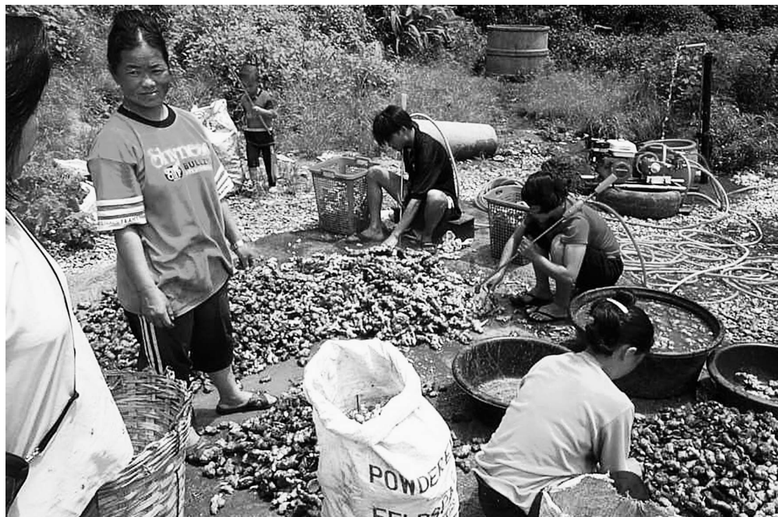
FIGURE 1 Hmong villagers in Nong Hoi washing recently harvested ginger. Ginger root was a traditional food collected in the forest; now it is a cash crop grown in permanent fields.

rented buffaloes to paddy rice cultivators. They ate the pigs and used the horses for conveying crops from fields to village. When times were difficult, they would sell the animals for cash or use them to barter for badly needed supplies. The present economy almost totally excludes raising large livestock, as there is virtually no forestland available for grazing animals.