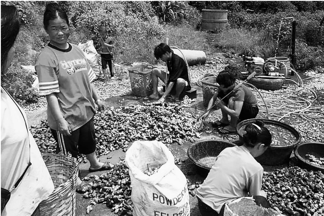
FIGURE 1 Hmong villagers in Nong Hoi washing recently harvested ginger. Ginger root was a traditional food collected in the forest; now it is a cash crop grown in permanent fields.

rented buffaloes to paddy rice cultivators. They ate the pigs and used the horses for conveying crops from fields to village. When times were difficult, they would sell the animals for cash or use them to barter for badly needed supplies. The present economy almost totally excludes raising large livestock, as there is virtually no forestland available for grazing animals.