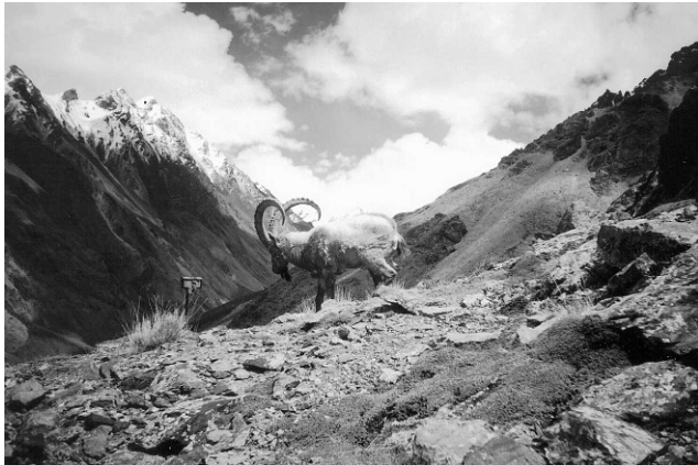
FIGURE 2 A Siberian ibex standing next to one of a pair of camera traps along a ridgeline.

the government (Braden 1984). The reserve was established for the protection of the alpine ecosystems of the Tien Shan and the rare species that occur there (specifically the snow leopard and the argali [ Ovis ammon ]). No hunting is permitted in SaryChat, although there are several villages located along the border, and extensive poaching by rangers and local villagers was previously reported (Koshkarev and Vyrypaev 2000).