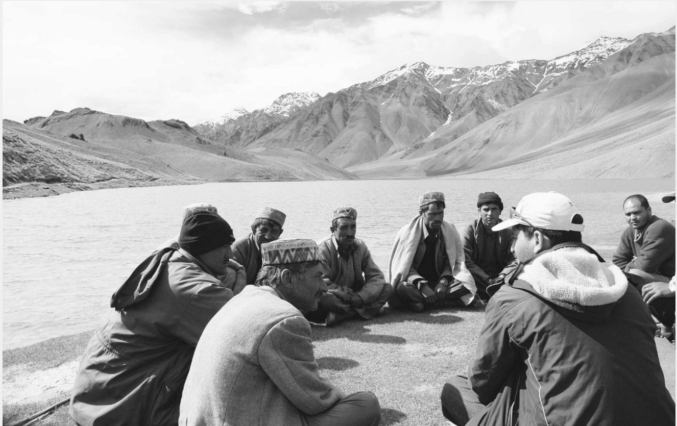
FIGURE 5 A group of local people discussing conservation issues on the banks of Chandrata Lake, Himachal Pradesh, India.

Lakes, permafrost and wetlands play a great role in regulating lateral flow of rivers. The increased air temperature results in earlier melting of the frozen soil and increased soil evaporation. This results in a decline in the groundwater table and water levels of the lakes, which reduces water supply of baseflows from groundwater and lake water. The water resources in the region declined between 1956 and 2004 due to the above changes. In addition, in some parts of the Yellow River, sources were converted from grassland to cropland, which adds to the problem.