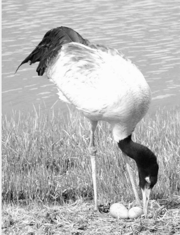
FIGURE 4 An endangered black-necked crane ( Grus nigricollis ) tending its eggs on the shore of a Ladakh high-altitude lake.