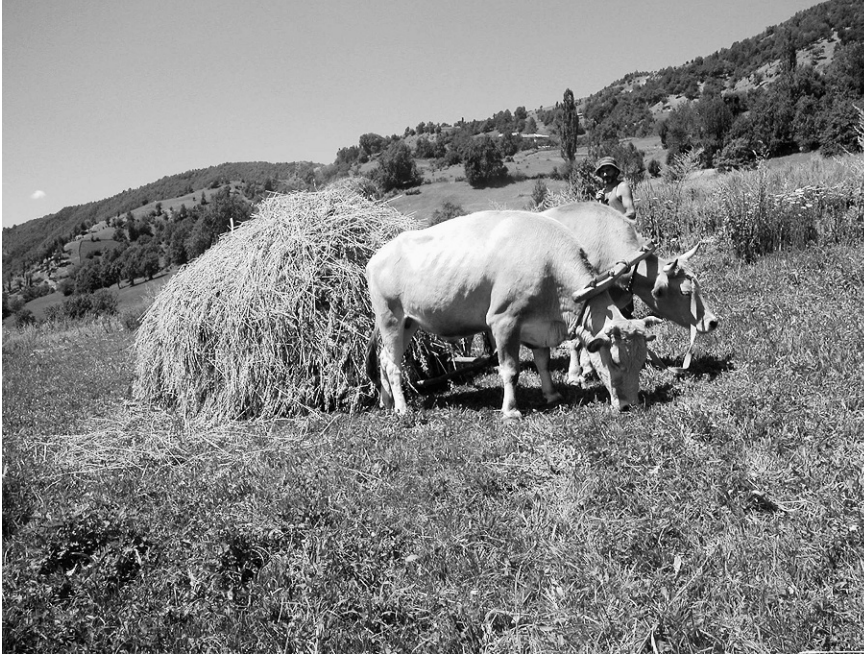
FIGURE 5 Ox-drawn sledge loaded with oats, v. Shkaleri (1307 m).

landraces of wheat and barley are used to prepare bread and beer for religious rituals. Substitution of these landraces by others would go against centuries-old traditions.