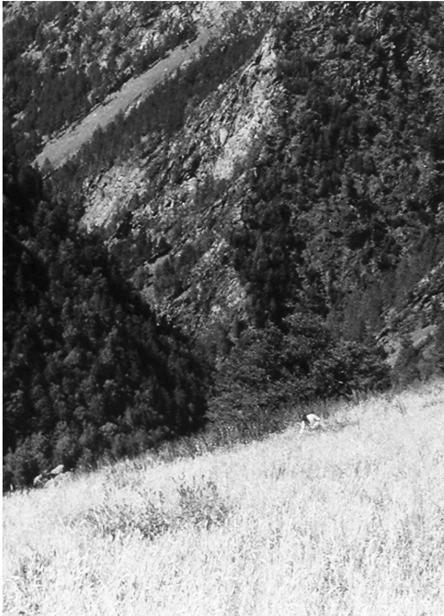
FIGURE 4 Highest registered wheat field in Georgia, in v. Chero (2160 m).

in such high villages. Most varieties growing in mountain areas are local landraces and cultivars. Mountain landraces of rye ( Secale cereale ) and barley ( Hordeum vulgare var. nudum , H. vulgare var. pallidum ) reach their highest elevations in v. Ushguli (see Figure 1). The highest wheat field ( T. aestivum var. lutescens ) was discovered in 1986 by Georgian botanists in v. Chero at 2160 m (Figure 4).