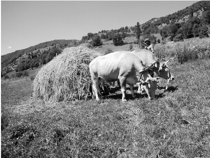
FIGURE 5 Ox-drawn sledge loaded with oats, v. Shkaleri (1307 m).

landraces of wheat and barley are used to prepare bread and beer for religious rituals. Substitution of these landraces by others would go against centuries-old traditions.