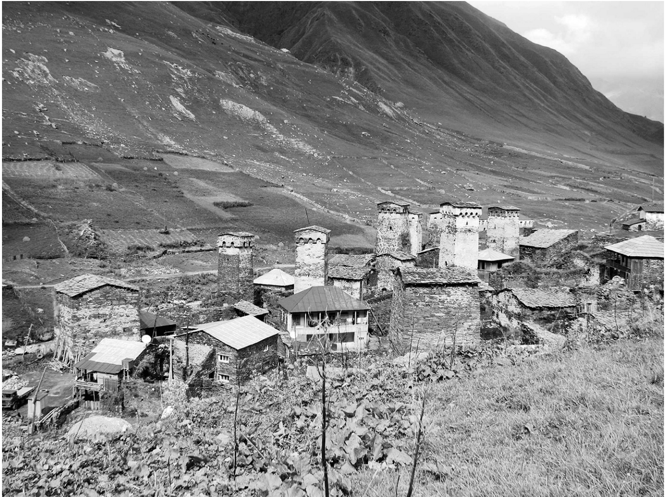
FIGURE 1 Rye and barley fields in v. Ushguli (2140).

local wild relatives of these crops (Vavilov 1931; Ketskhoveli 1957), representing primary gene pool species still to be found in the wild today (Akhalkatsi 2009).