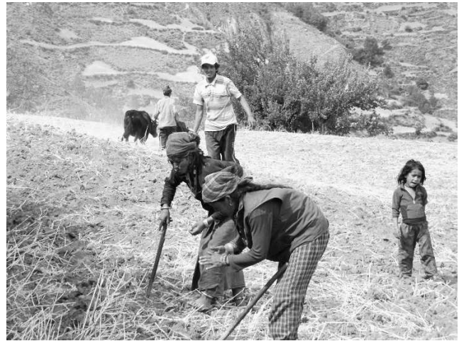
FIGURE 2 Dalit and Lama women, men, and a child involved in land preparation in Burgaon village.

them from going to school (Figure 2). Thus, the adaptive strategy of planting drought-resistant crops such as fapar reinforced gendered patterns of agricultural work, because women assumed a disproportionate share of farm production and household reproduction. The resilience of these gender practices shapes adaptive strategies and tends to maintain, if not exacerbate, the disadvantaged position of the women farmers under study.