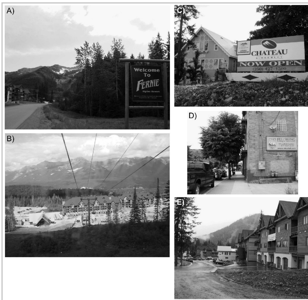
FIGURE 2 Many British Columbian interior towns, which in the past had relied on extractive industries such as forestry and mining, are gradually transforming into resort towns. Study locations: (A) View of Fernie Alpine Resort; (B) the Kicking Horse Ski Resort in Golden; (C) a mining headquarters transformed into a hotel in Kimberley; (D) a heli-ski business in downtown Revelstoke; and (E) Rossland's Red Mountain Ski Resort condominiums.

The town is a short distance from Mount Revelstoke (1943 m) and Glacier National Park. One of the key elements under consideration for development is Mt. McKenzie (2143 m), which used to be a community ski hill. Renamed as the Revelstoke Mountain Resort, its first resort phase was completed in 2007. The absolute number of amenity migrants has been the highest in Revelstoke, peaking in 1992 (>350 people), declining somewhat in 2006 (>270 people), and steadily rising since 2004 (Pacific Analytics Inc. 2009).