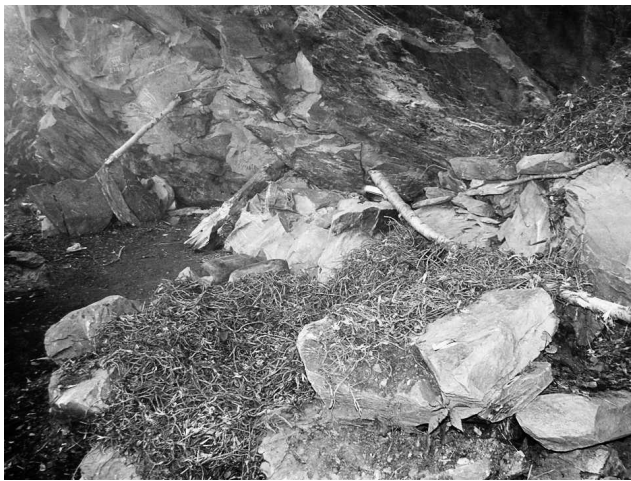
FIGURE 2 Collectors' camp under rocks: note the living space and sun drying of kutki on rocks.

Of the 85 collectors interviewed, 95.29% ( n = 81 ) were dedicated and 4.71% ( n = 4 ) were opportunistic. Dedicated collectors are those who camp and collect medicinal plants for a longer duration (up to 3 weeks) in very remote areas and focus on collection of a single species, while opportunistic collectors combine this with other activities such as livestock grazing and fuelwood collection (Olsen 1998) and may include collection of multiple species. Women were generally opportunistic collectors in the study area. The collectors reported many serious injuries, including the death of 1 person in 2009 during Picrorhiza collection on steep slopes.