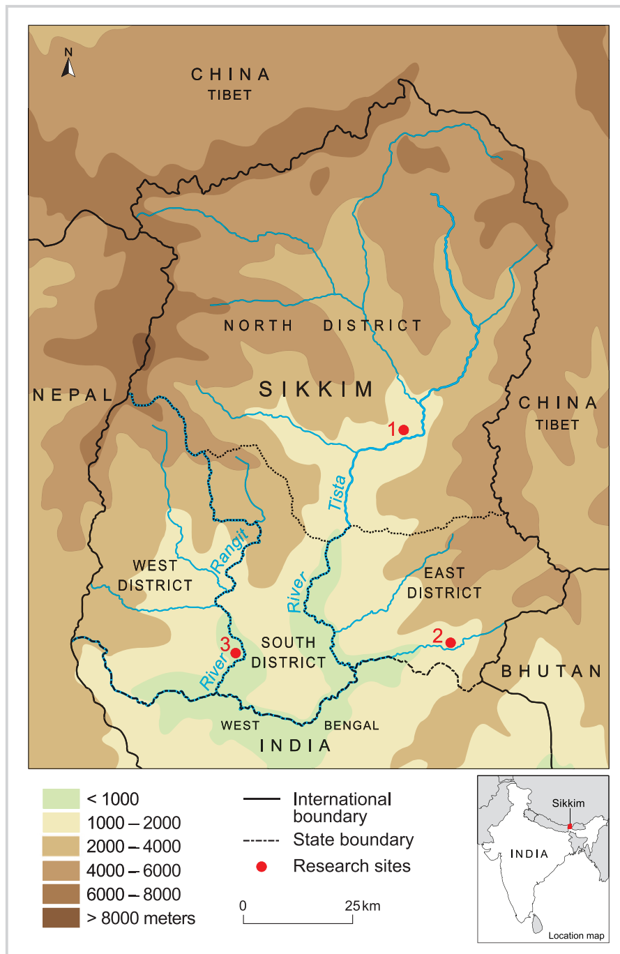
FIGURE 1 Map of Sikkim showing drainage and research sites. (1) Shipgyer; (2) Chujachen; (3) MSK. (Map by Chandra Jayasuriya)

Subba 2008). The state has rugged terrain and unstable rocks dissected by actively eroding streams and rivers. The whole state is well drained by numerous tributaries of the River Teesta, the main one being the Rangit (Figure 1).