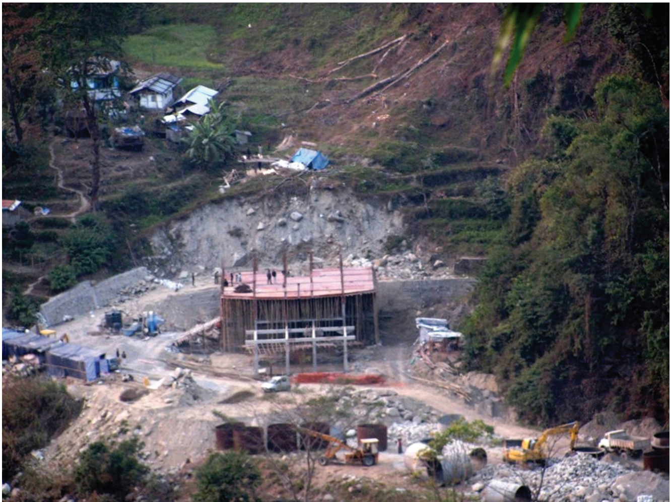
FIGURE 2 Site of a hydroelectricity project construction on former agricultural land in Sikkim. Remnants of agricultural terraces are visible around construction.

Many villagers said that the village forests they traditionally used for firewood and fodder collection were destroyed by construction work. Agricultural and forest land impacts were mostly temporary and could be reversed by applying suitable mitigation measures, as indicated in Table 1.