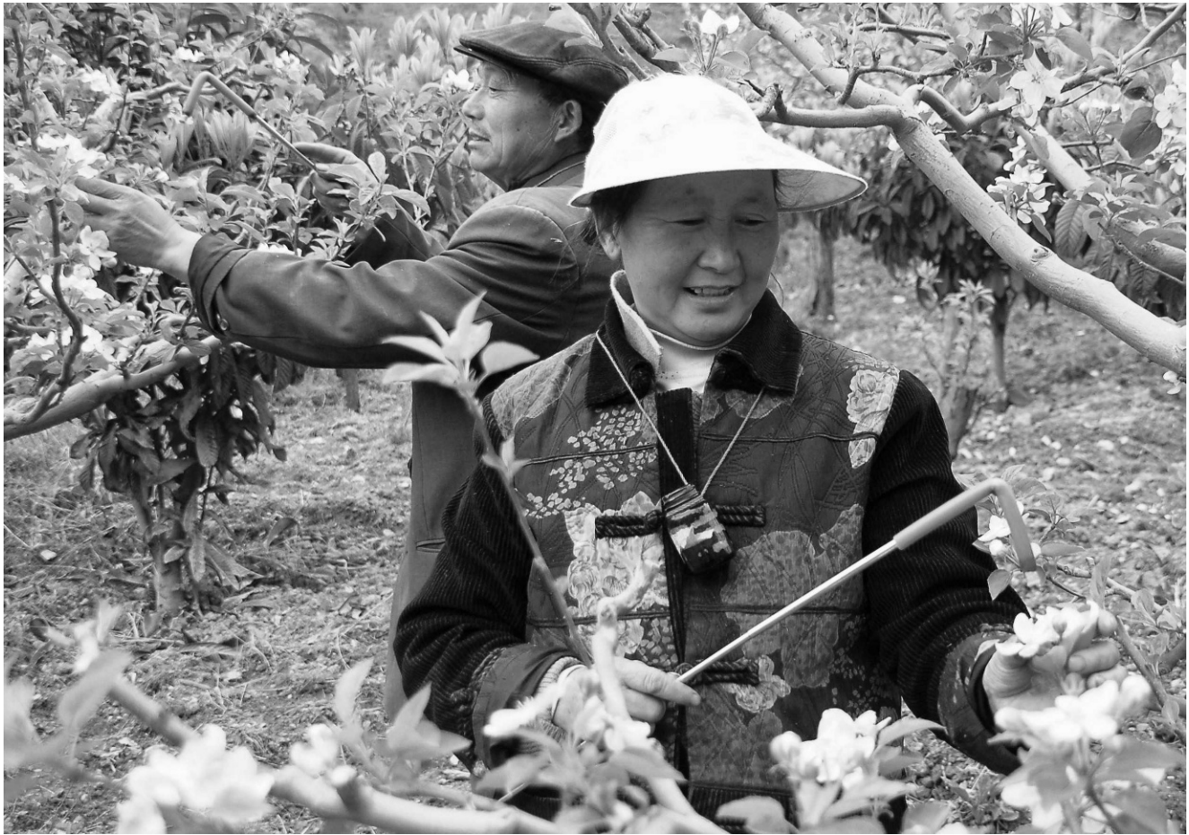
FIGURE 2 Farmers pollinating apple flowers in Feng Mao village.

chosen for gathering folk observations about the scale and pace of changes in agricultural systems and climate. A few beekeepers in the valley were also interviewed to understand access to beekeeping as a tool for managing fruit pollination in the valley and whether farmers are now using it. Secondary data on population, agriculture, average land holdings, and meteorology were accessed from literature and government sources.