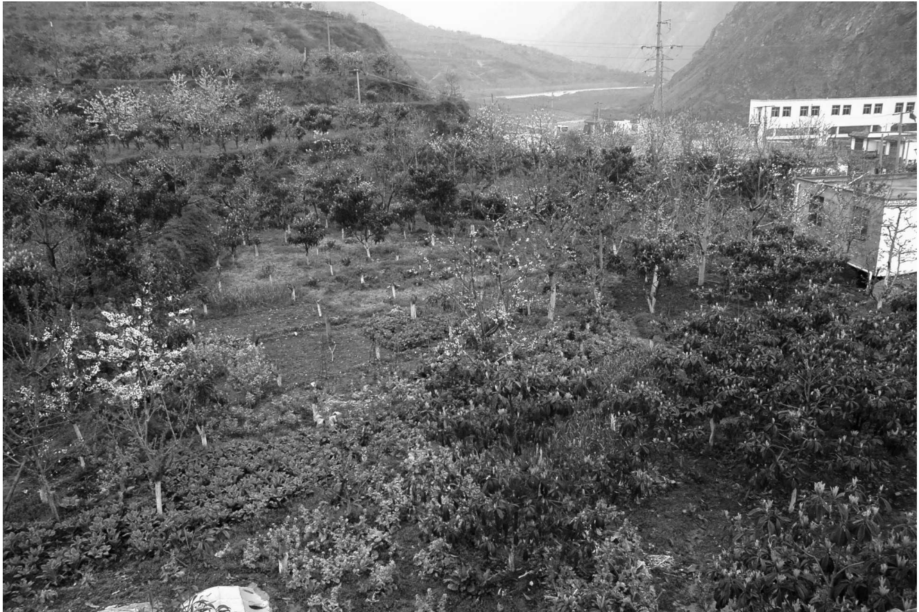
FIGURE 4 Mixed fruit farming in study area. An orchard with apples, cherries, plums, loquats, and vegetables in Feng Mao village.

hiring them varies from US$ 12–19/person/d, which has led to a substantial increase in the cost of producing apples. This, coupled with the falling market prices for Maoxian apples, has been the key factor that compelled farmers to look for other crops.