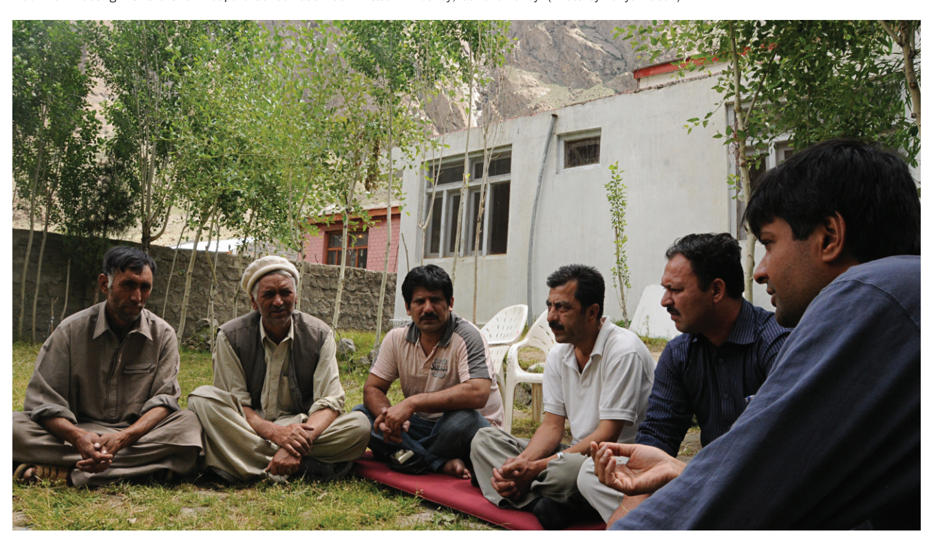
FIGURE 3 Meeting with the Snow Leopard Conservation Committee in Hushey, Ganche Valley.

catalyst for bridging cultural and economic differences among factions within the community.