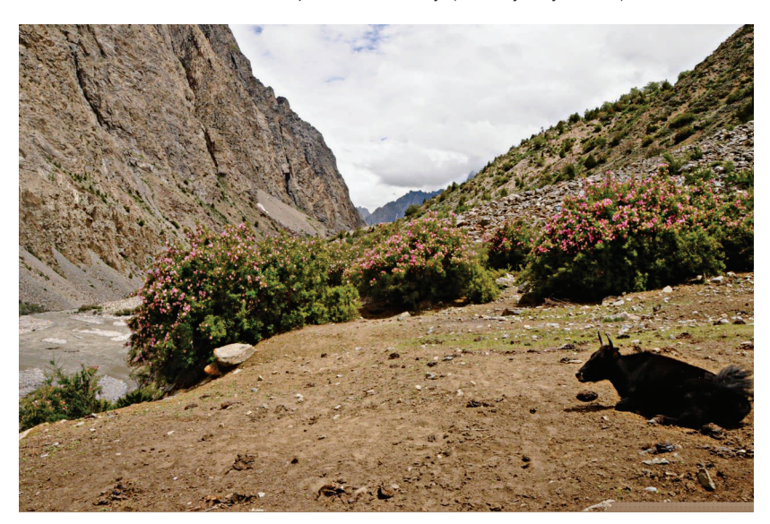
FIGURE 1 Yak on one of the summer pastures of Hushey.

domestic stock. While Himalayan ibex ( Capra sibirica ) and in some areas markhor ( Capra falconeri ) remain important food staples, along with other small mammals and birds, snow leopards feed to a large degree on domestic livestock, including yak, goat, and sheep (Mishra 1997; Anwar et al 2011).