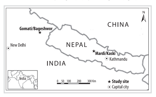
FIGURE 2 Location of study villages. (Map by Prem Sagar Chapagain)

conservative ones in Nepal. The twofold intention of the comparison is, as stated previously, to document variation and to identify circumstances that are favorable to innovation.