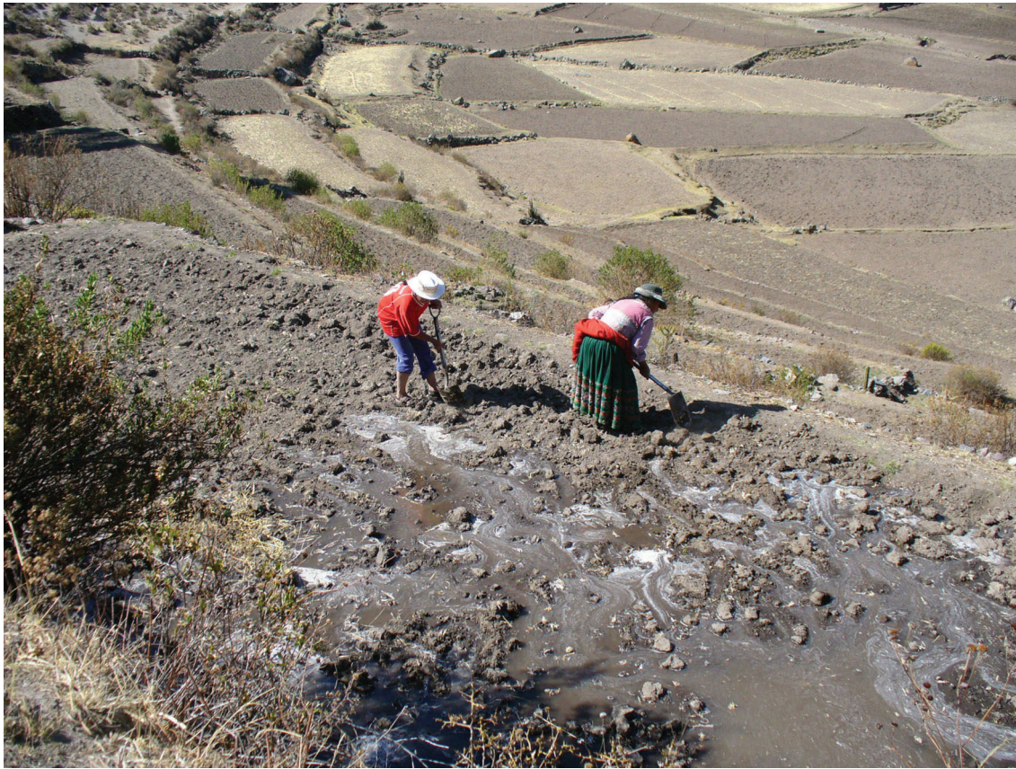
FIGURE 2 The Colca Valley is famed for its terraces and its aridity. This photo shows the steep terraced landscape and local irrigation practices under which land is carefully maintained and irrigated with available water.

PROFODUA (Programa de Formalización de Derechos de Uso de Agua [Program to Formalize Rights to Use Water]). PROFODUA granted and formalized the use of water rights individually and in blocks, thus avoiding use of the term “collective rights.” Such rights could be traded or exchanged by their holders, which meant that conditions were in place for a market in water rights to emerge. Some Andean communities, including the Colca Valley, resisted the implementation of PROFODUA. They demanded the recognition of their communal right to water and rejected individual entitlements. Because of this contentious issue, PROFODUA only formalized the individual water rights of users in blocks of the coastal irrigation systems (Vera 2011).