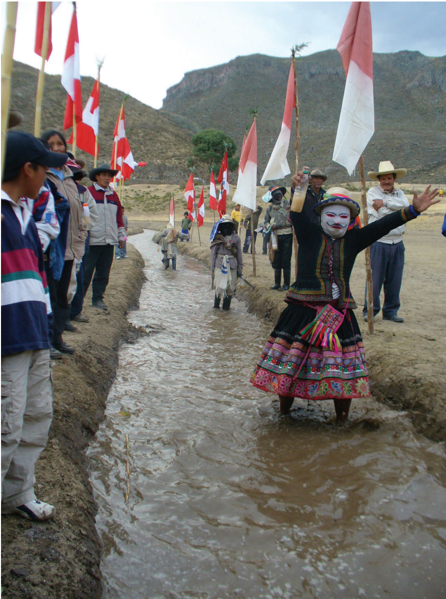
FIGURE 3 Water management in Coporaque includes many customary practices that play a key role in reproducing local water rights, alongside the standardized rules of the Water User Association.

with local preferences in irrigation management, still runs across the communities of the Colca Valley. As shown here, the nature of struggles to claim water and take-up of new water governance rules and recommended irrigation practices do vary across the Colca Valley, and these differences demonstrate the ethno-politics of water governance emerging alongside the state Water Law (Vera 2011). Ethno-politics show us the processes by which communities, while still maintaining their collective identity, increase their security of water supply not only through conflictive processes of cultural politics or frontal resistance, but also through alternative and creative processes; whereby people appropriate, adapt