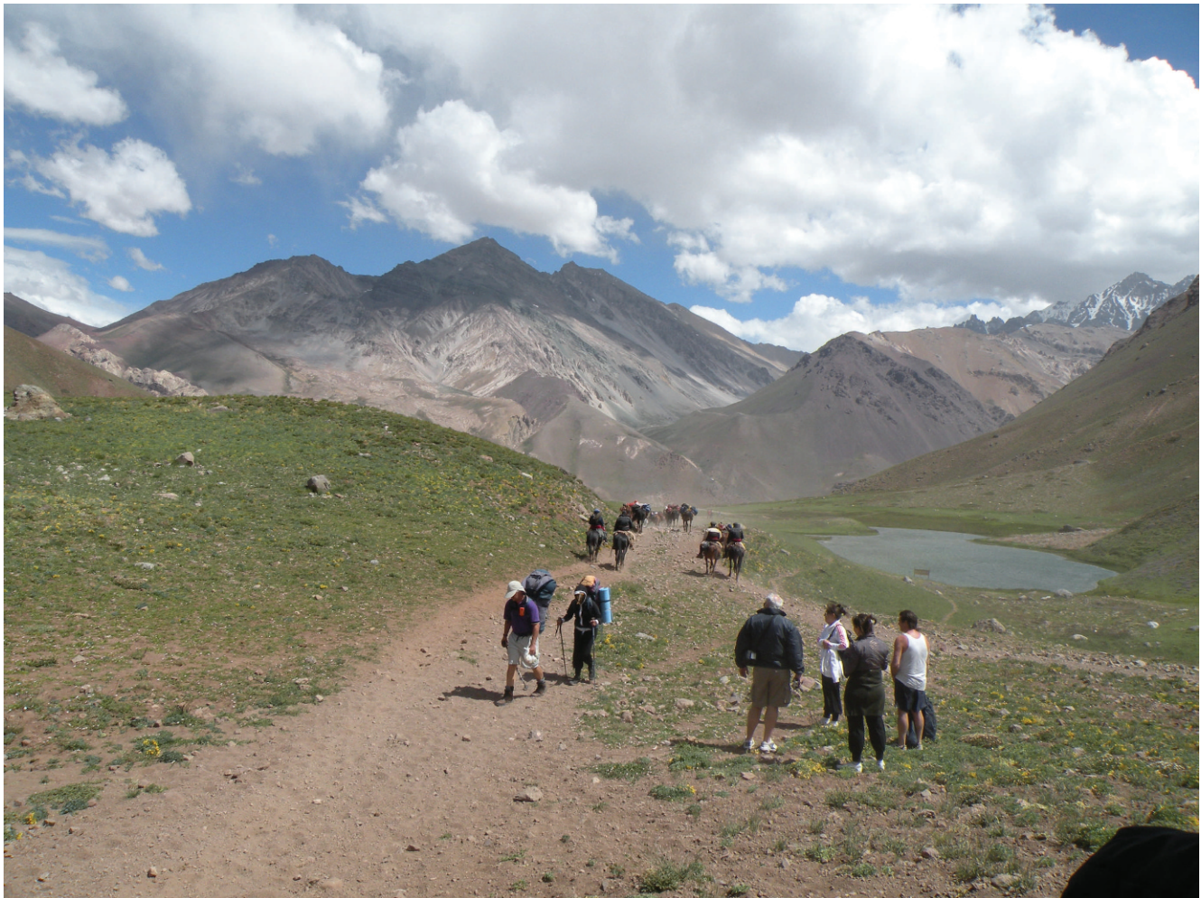
FIGURE 3 Trail use by visitors and pack animals in Horcones Valley, Aconcagua Provincial Park, Mendoza, Argentina.

Reduced propagule pressure at higher elevations, more remote areas of park, or both may also be limiting the spread of non-natives farther into the park, as has been found in other regions (Pauchard and Alaback 2004; Pauchard et al 2009; Speziale and Ezcurra 2011). Paralleling reduced propagule pressure is reduced disturbance by trampling by tourists and by trampling and grazing by pack animals of the natural vegetation higher and farther in the park, which is also likely to be restricting the establishment and spread of non-natives. The relative importance of these factors is difficult to determine, because they are all correlated with elevation, as has been found in other research that examined non-native species distributions along a gradient in the Patagonian Andes (Pauchard and Alaback 2004).