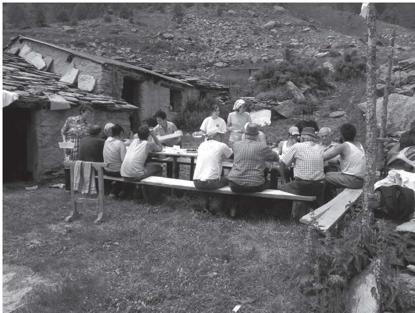
FIGURE 2 Extended pastoral family having lunch with helping friends and neighbors after ascending to the summer pastures in Bobbio Pellice municipality, July 2013.

Small as it is, the sample of 15 families that was the focus of the in-depth study conducted in the Pellice Valley, and especially in the 2 municipalities of Bobbio (44°48'00"N 7°07'00"E, 732 m) and Villar (44°48'00"N 7°10'00"E, 664 m), is quite revealing in this sense. If we first look at families as sets of kin by blood or marriage (or cohabitational relationship) who live together under the same roof, we discover that these 15 households, accounting for over 80% of the families engaged in pastoralism in the valley, have a mean size of 3.87 members, significantly larger than the estimates of 1.83 and 2.02 members for Bobbio and Villar, respectively (ISTAT 2012), and that they range in size from 2 to 7, very much in accordance with the number and kinds of animals they breed. No less than 7 out of 15 pastoral households are not nuclear in structure; 6 of the 7 are 3- or 4-generational. One household consists of a married couple in their 50s, their 2 adult daughters and the elderly parents of both husband and wife; another highly complex domestic group includes a married man and his wife, the wife's mother, the couple's adult son, a daughter and her partner, and a grandson. In 2 small households, young adult men live with their grandparents. Both size and structure set pastoral households apart from most other households in the Pellice Valley.