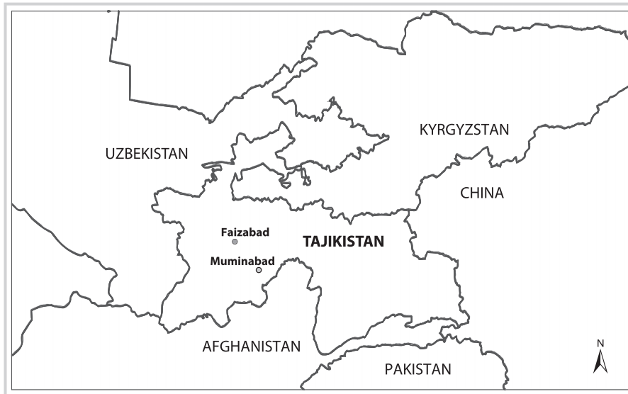
FIGURE 2 Location of the 2 study areas. (Map by Bettina Wolfgramm)

was defined using the area of land managed and number of animals kept—common criteria in similar studies (Shepherd and Soule 1998; Pfister 2003; Shigaeva et al 2007). We divided the smallholders participating in the study into 3 categories: small, medium, and large. For each smallholder category, parameters were derived from the interview data. Stocks and flows of biomass were calculated on the basis of these parameters.