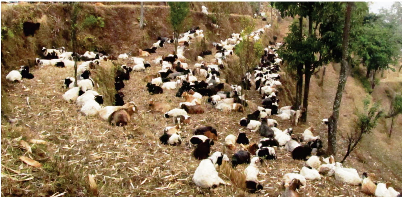
FIGURE 2 A sheep and goat herd on the way to winter pastures.

direct and indirect contributions. The major contribution was cash income from the sale of livestock. As reported by interviewees, each herd owner sells about 15–25 livestock per year (about 7% of the total). This generates a total of about 3 million NRs ( \approx US$ 35,000) for the 14 goths in the research area in Ghermu VDC, or an average gross annual income of about US$ 2500 per herder. The indirect contributions reported by informants included provision of manure for farmlands, employment, as well as cultural values, as explained by a herder interviewee: “Sheep have a cultural and spiritual value in the Gurung community, and we need sheep in most of our religious and cultural functions.”