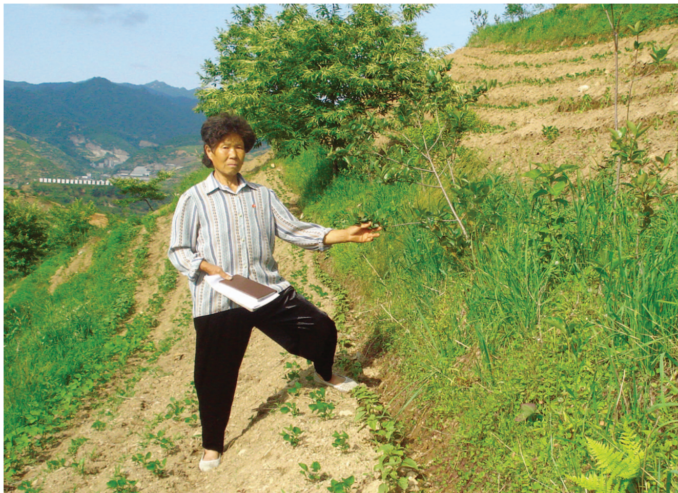
FIGURE 2 Selecting the right species not only helps to restore the ecosystem but can also contribute to local livelihoods. (Photo by Jianchu Xu, taken in Suan County in 2012)

Currently, however, there is limited information on the selection of indigenous tree species for sloping-land agroforestry, in particular on participatory experiences in a highly centralized country like North Korea. Drawing on empirical data, this research highlights the importance of such an approach. It may produce valuable insights for participatory research and practice in 3 aspects: