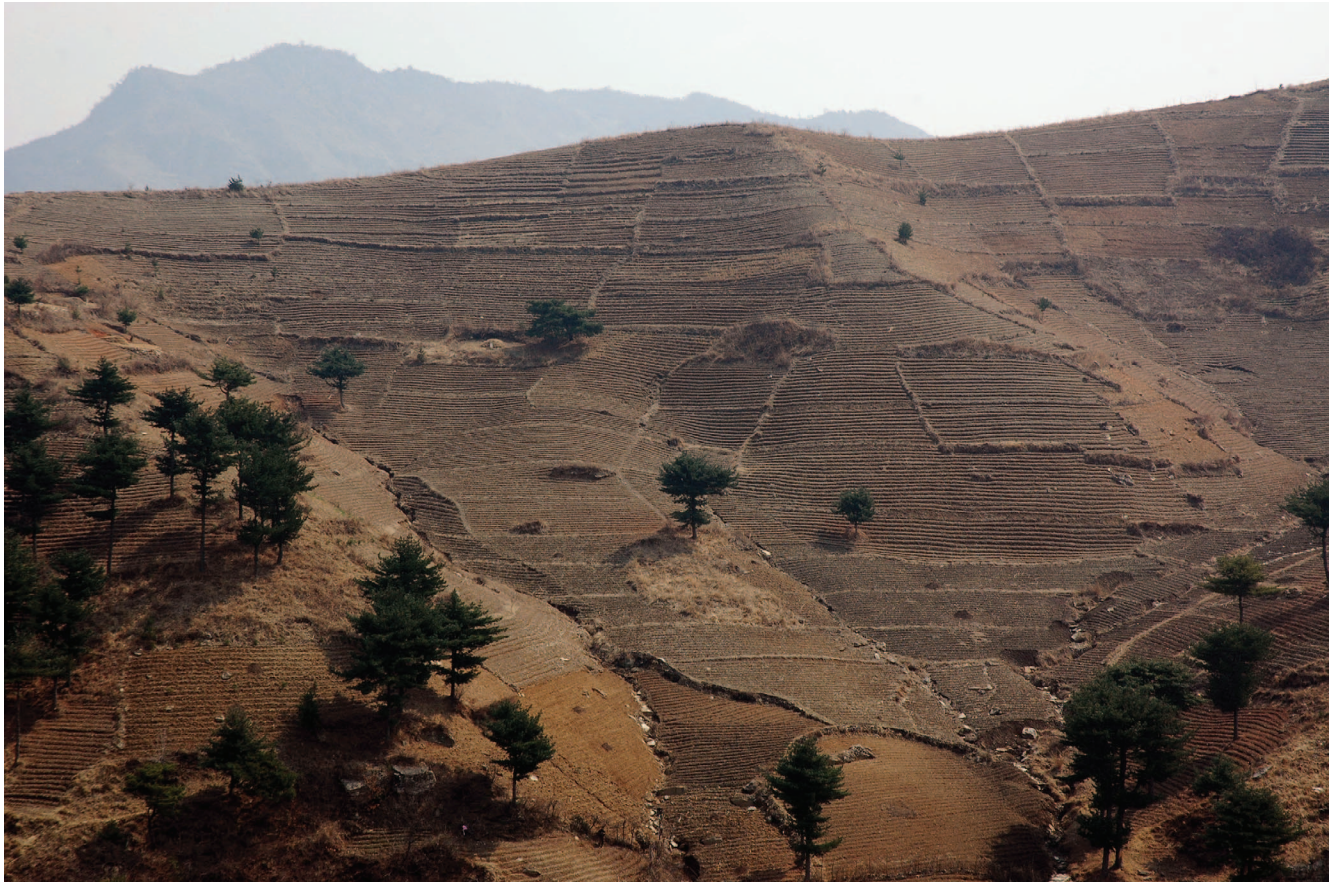
FIGURE 1 Extensive farming on steep slopes after famine in the 1990s. (Photo by Jianchu Xu, taken in North Hwanghae Province in 2008)

constituted the most important criteria (Franzel et al 1995). Therefore, the principle of “right species for right place” requires that the preferences of local stakeholders and ecological suitability both be considered, paying particular attention to local ecological knowledge (Reubens et al 2011; Suárez et al 2012). There is an urgent need to develop ways to manage sloping land that strengthen the multifunctionality of the forest ecosystem and focus on multipurpose species selection.