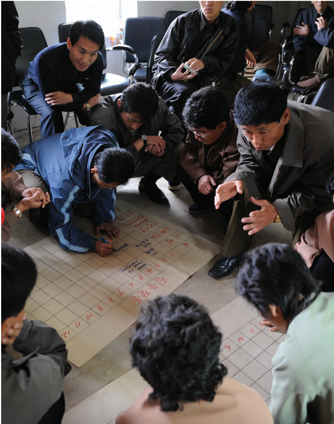
FIGURE 4 The participatory approach empowers local people to become involved in decisions about tree species selection for agroforestry on sloping land.

and land-use types (eg agroforestry or timber system), and should yield the products and services (eg fruit, timber, firewood, other income-yielding products, and erosion control) prioritized by the land managers, in this case the