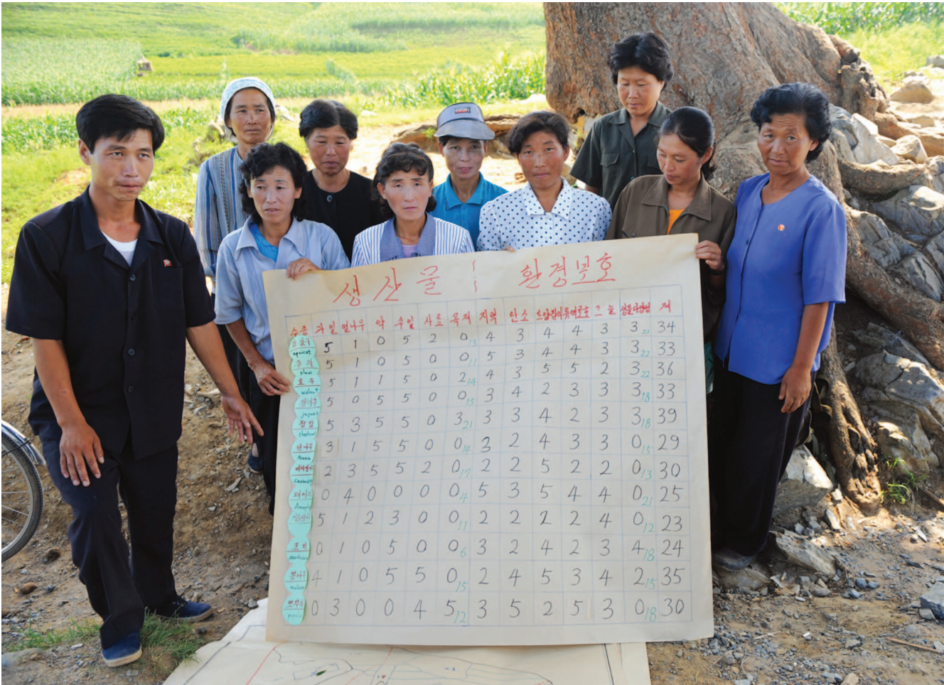
FIGURE 5 Quantitative results from participatory exercises can be especially convincing.

the National Agroforestry Strategy, which aims to scale up the pilot project to the entire country. The launch of the National Agroforestry Policy is a landmark for North Korea. However, large-scale implementation of participatory agroforestry still requires additional international aid and capacity building.