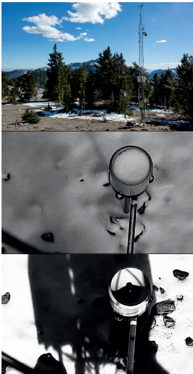
FIGURE 3 Using a webcam as part of an environmental sensor deployment (top) allows the operator to capture images that assist data quality control. In this case, hourly images can show if precipitation is in solid form (middle), which is not usually captured properly by instruments such as a liquid tipping bucket gauge (bottom).