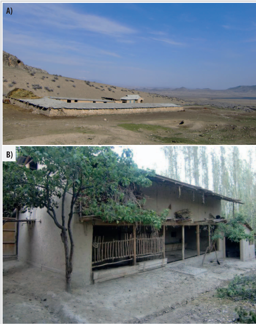
FIGURE 2 (A) The winter shed of a large-herd owner on the winter pasture site; (B) a herder's winter shed on his household plot. (Photos by Munavar Zhumanova, fieldwork 2014–2015)

socioeconomic and individual-level differences between both groups are presented in Table 1.