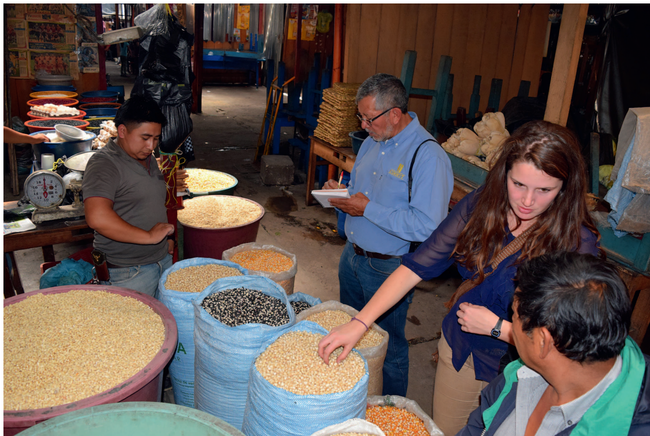
FIGURE 5 Native and improved maize varieties at the Chichicastenango market.

department in the north of Guatemala). Maize from El Petén is largely consumed in that region, and most of the maize purchased in the western highlands originates in Mexico.