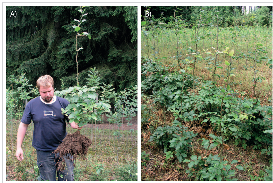
FIGURE 4 Bare-rooted saplings (depicted European beech) used in the diversification project to complement the common-sized planting stock. The fibrous root systems of the saplings are concentrated under the stem. The aboveground parts of the saplings are formatively pruned to reduce the growth and occurrence of coarse lateral branches.

and, eventually, also the soil chemistry at the diversified sites. The nutritional status was assessed on the basis of foliar analyses (Kuneš et al 2011). If N was needed to expedite the initial growth of plantations (apart from soil bases and P), it was applied as the condensation products of urea and formaldehyde (Jahns et al 1999, 2003; Jahns and Kaltwasser 2000) to avoid increased nitrification activity in the soil (Aarnio and Martikainen 1995).