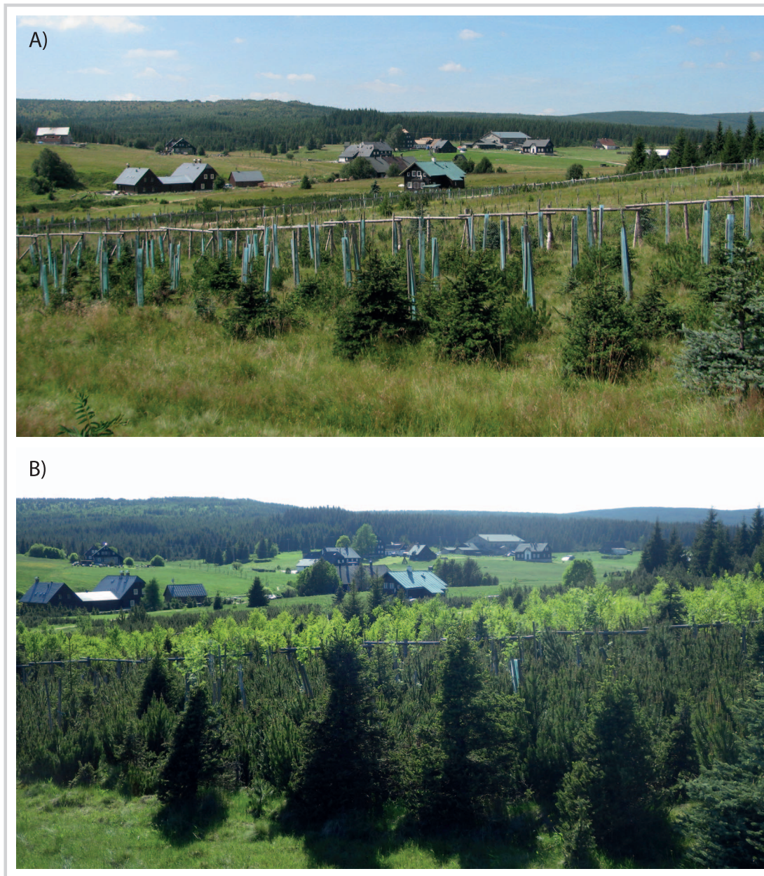
FIGURE 5 Diversification center (GPS: N 50°49.15022', E 15°21.12077') situated in a frost pocket close to the Jizerka settlement on the upper plateau of the Jizera Mountains. (A) A newly established center in the summer of 2009; (B) 7 years later with plantation of Carpathian birch ( Betula carpatica ), see the light-green crowns in the background, introduced to an older stand of Norway spruce ( Picea abies ), dwarf pine ( Pinus mugo ), and blue spruce ( Picea pungens ).

capreolus L.) and/or hares ( Lepus europaeus Pallas). In the outer zones (ie outside of the fenced exclosures), protection was provided by plastic tube shelters (Figures 2, 5) or tree guards (Figure S4, Supplemental material , https://doi.org/10.1659/MRD-JOURNAL-D-19-00059.1.S1 ). The plastic shelters must be at least 170 cm tall. Recently, we have used seamless, twin-walled tube shelters that are 180 cm tall. Fencing must be robust to resist the deformation forces of snow cover and rime. It should be approximately 170–190 cm tall to be red-deer safe (Figure S9, Supplemental material , https://doi.org/10.1659/MRD-JOURNAL-D-19-00059.1.S1 ).