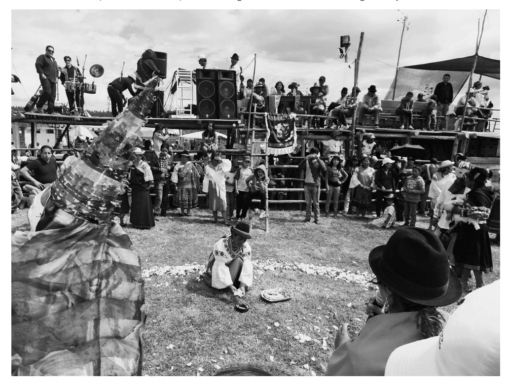
FIGURE 3 A toros del pueblo event in Paquiestancia begins with a traditional blessing done by the leader of the community (June 2014).

cultural identity and community cohesion. Indeed, the yearly summer festivals in the region, including San Pedro, San Juan, and Inti Raymi, feature competitions of chagra skills and ganado bravo in a series of events. Known colloquially as toros del pueblo , these events often begin with local indigenous traditional ritual blessings (Figure 3). Although many people