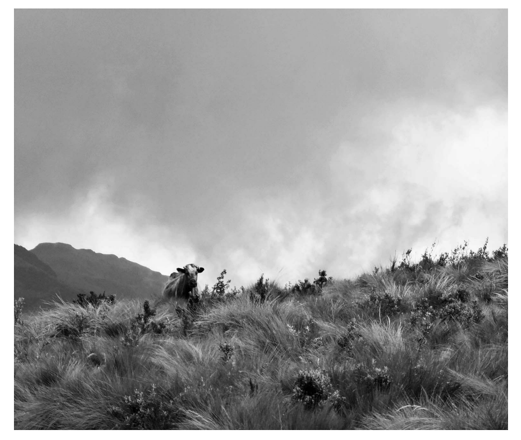
FIGURE 2 A lone ganado bravo roaming freely in the páramo on Cayambe volcano (July 2012).

supported projects in various communities in the region to improve and intensify dairy production. In Paquiestancia, this included a proposal for a pasture-seeding program to allow more intensive grazing on smaller properties near homes at lower elevations (FONAG 2011). In other Kayambi communities, it has included the support of improved pastures as well as veterinary care.