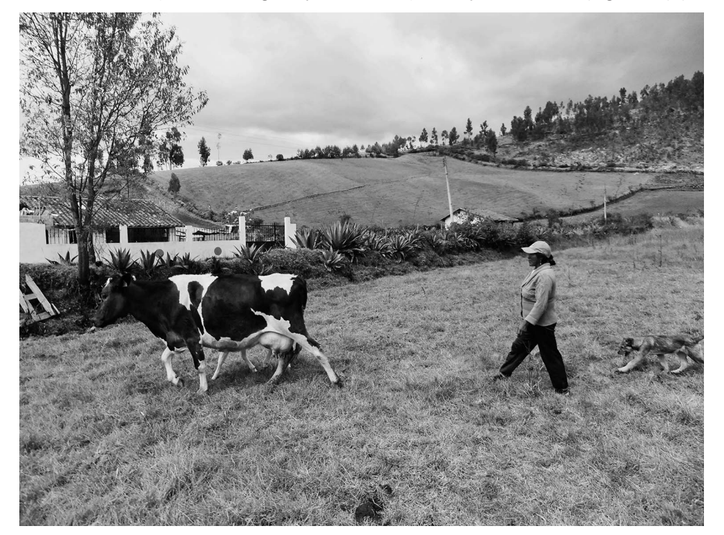
FIGURE 1 Woman in Paquiestancia herding a dairy cow and calf in pasture adjacent to her home (August 2014).

other communities involved with FONAG in Cayambe cantón .