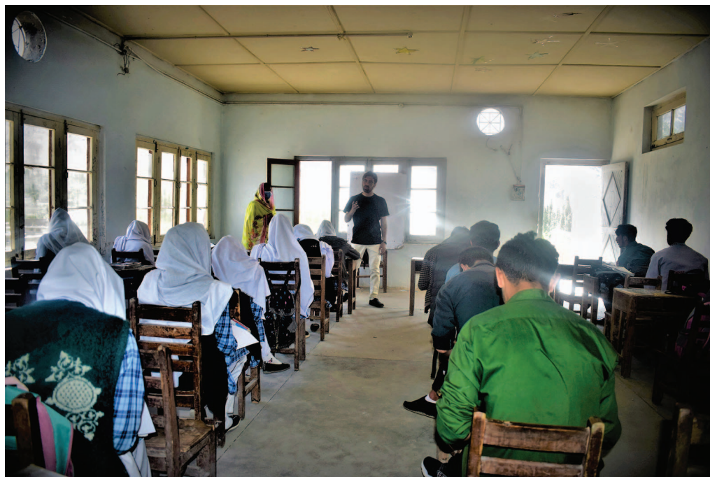
FIGURE 2 Interaction with students during a workshop in a local community school in Yasin Valley.

S = F/(NmP) , where S indicates the cognitive salience index, F represents the frequency of citation, N is the number of elements, and mP is the mean position of each element used in the free lists. The cognitive salience index varies between 0 and 1. The index is generally used to identify the most important plant species used in a specific community or cultural group.