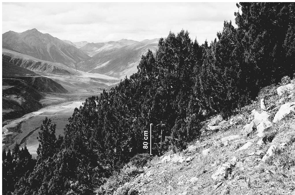
FIGURE 2 Highest forest stand of Juniperus tibetica in southeastern Tibet, located at 4900 m (29°42' N / 96°45' E Gr). (Photo by Georg Miehe, 17 September 2004)

Asia (Miehe and Miehe 2000) confirm widely accepted evidence that the upper limit of the forest belt is not a line but an ecotone (Körner 1999). The 'highest tree-line' therefore designates an imaginary line connecting scapose phanerophytes. In most humid mountain ranges, single or multi-stemmed woody perennials become increasingly less abundant, forming a pattern that shifts from a closed crown-interlocking forest to isolated individuals. Simultaneously, their heights gradually decrease until they barely emerge from a closed layer of shrubs (Miehe and Miehe 2000).