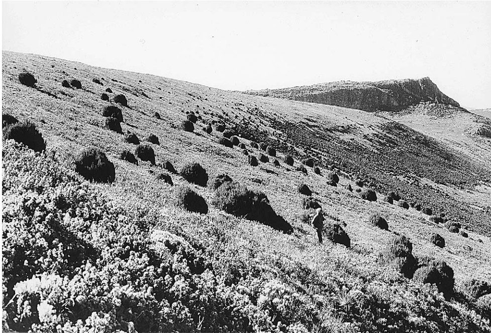
FIGURE 3 Probably undisturbed treeline ecotone in southern Ethiopia: Erica thicket disintegrates into isolated spherical individuals. The soil is completely shaded with a thicket of 30 to 50 low scrambling Alchemilla haumannii . Bale Mountains, Wasama, 6°55' N / 39°46' E, 4080 m. (Photo by Georg Miehe, 11 January 1990)

(21 August, 16–19 September 2004) suggest that this valley is a wind channel for strong and dry southerly winds. Since the radiative forcing at the site is certainly very different from that recorded at the nearest climate stations, it is doubtful whether any conclusions about the climatic conditions at the local treeline can be drawn, as the climatic causes of treelines are still under-investigated (Körner and Paulsen 2004).