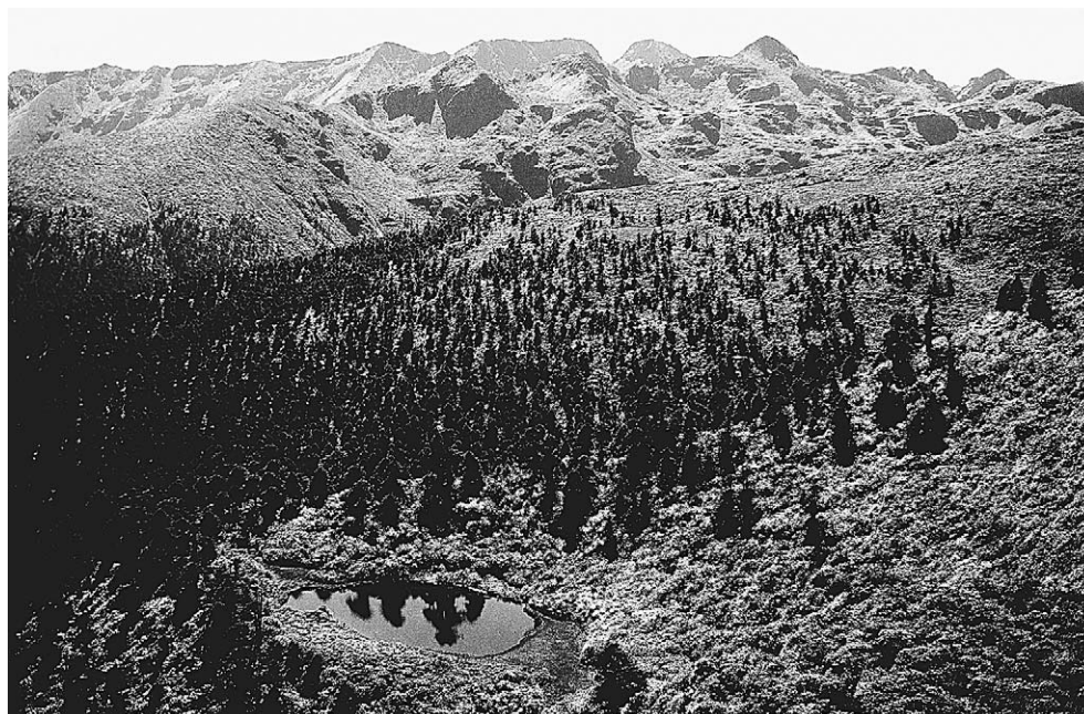
FIGURE 4 Black Mountains, Central Bhutan, 27°23' N / 0°42' E, 4250 m: probably undisturbed treeline ecotone of the southeastern Himalaya: in the treeline ecotone with a closed evergreen broadleaved rhododendron thicket, closed Abies densa forests disintegrate into isolated trees. (Photo by Georg Miehe, 16 October 1998)

highest vegetation layer disintegrates over a vertical distance of only 50 to 100 m into isolated Erica shrubs or Abies densa trees, emerging from a closed carpet of 30–50-cm tall Alchemilla haumannii in Africa, or a closed thicket of 1- to 2-m tall evergreen rhododendrons in the Himalayas.