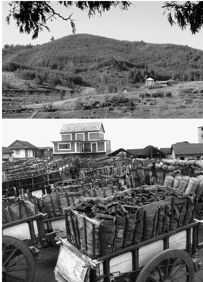
FIGURE 4 The charcoal-producing heights: hills covered with A. dealbata woodlots at Antsampandrano; charcoal market in nearby Kianjasoa.

stantly rejuvenating the population. As wattles are typically 'wild,' unowned, and a low priority for foresters, few pay attention when a hillside of grasses and scrubby wattles burns. In contrast, farmers actively protect their valuable private wattle woodlots in the charcoal-producing Antsampandrano region.