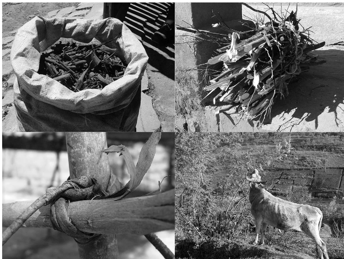
FIGURE 3 Uses of wattles. Clockwise: a sack of tanbark; a firewood bundle; use of leaves as cattle forage; use for posts and tying.

1971; de Neergaard et al 2005). As a result, wattles are self-reproducing multi-purpose shrubs utilized frequently by nearby farmers for a wide variety of purposes (Table 1; Figure 3).