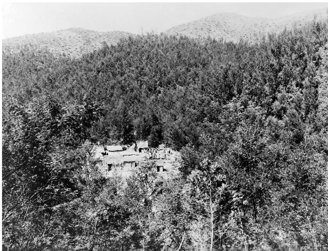
FIGURE 2 An A. mearnsii plantation for tanbark production near Angavo owned by the Société Minière et Foncière, around 1930.

operator in a key wattle zone, and several representatives from the tannin industry.