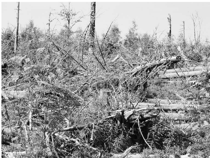
FIGURE 1 Dynamics of natural reforestation along the “Lothar” trail in the Black Forest, Germany: within a few years of the devastating 1999 storm, young trees could be seen thriving between the dead wood left lying on the ground. (Photo by Heidi Megerle, 2005)

Because a storm-devastated forest area can only be observed safely from a distance, an adventure trail had to be constructed to make the area accessible to the general public. This trail now provides thrilling insight in the form of a fixed rope route, leading over and under fallen trees. By contrast with the still very