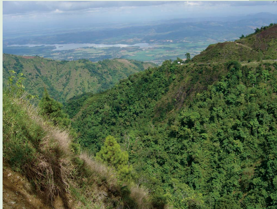
FIGURE 2 Forest regrowth over abandoned grasslands in the Central Cordillera of the Dominican Republic, favoring the conservation of water resources for the lowlands. (Photo by H. Ricardo Grau, 2004)

Conserving natural environments while also feeding the growing human population requires high productivity per hectare. Otherwise, most or all natural systems would have to be converted to agriculture. Therefore, by moving to urban areas, where the population consumes agricultural products from more efficient systems, migrants help to conserve land for nature and preserve natural ecosystems in mountain regions. In addition to a reduction in agricultural activities, rural–urban migration will lead to a reduction in grazing, hunting, and firewood collection in mountain areas, which should also promote natural ecosystem recovery. This has important consequences for sustainable development because mountain ecosystems are particularly fragile and have a disproportionate importance in terms of watershed protection and biodiversity conservation.