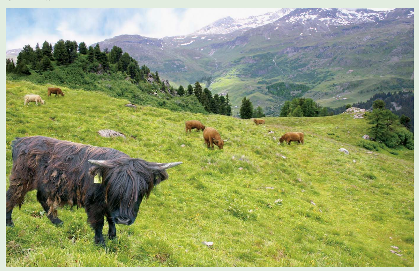
FIGURE 2 Business as Usual with (untypical) Scottish Highland cattle, illustrating a trend towards niche production.