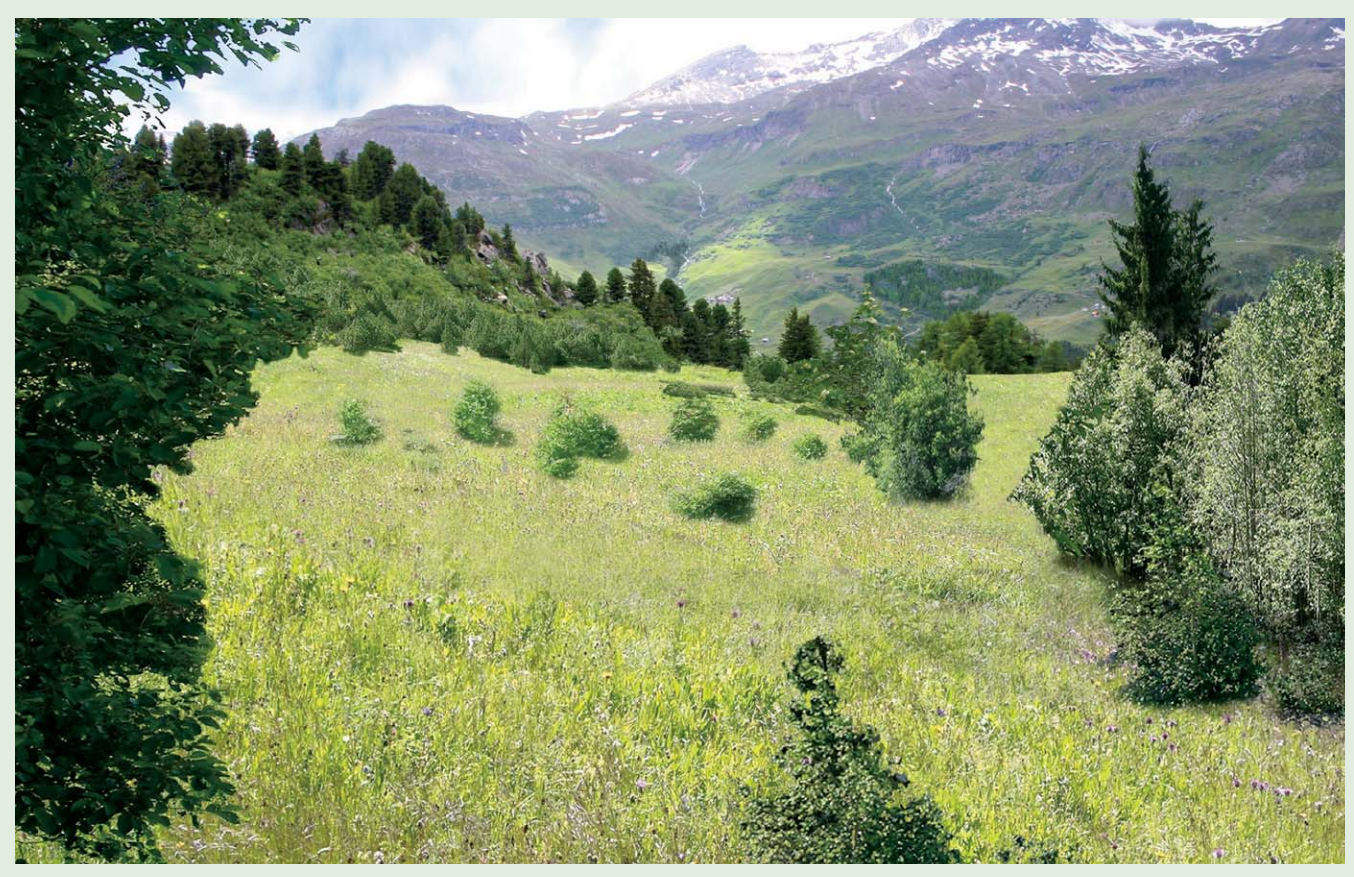
FIGURE 4 Agricultural Liberalization showing an early stage of vegetational succession.