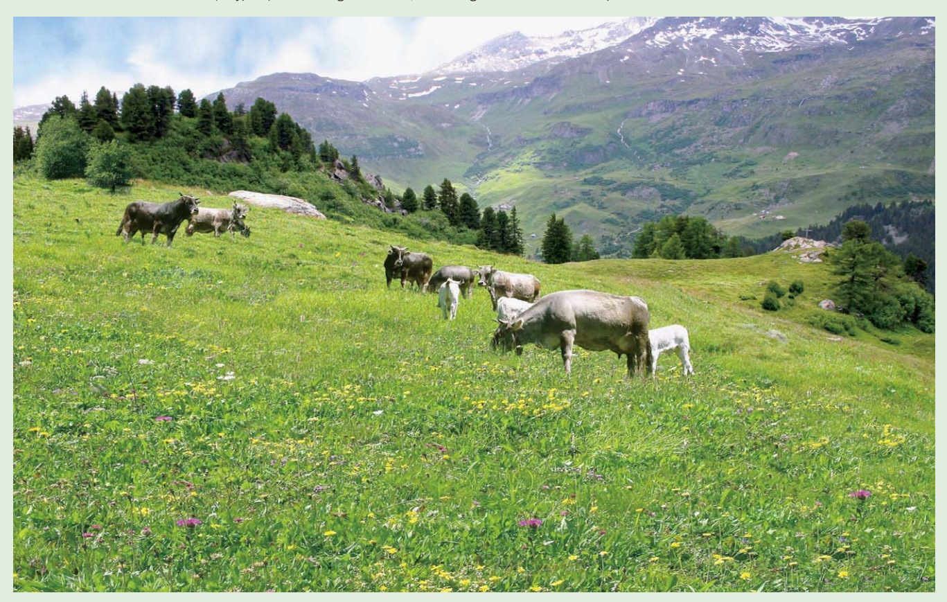
FIGURE 3 Biodiversity Enhancement with Rhaetian Grey cattle (a traditional local breed) and a high diversity of herbs and flowers.