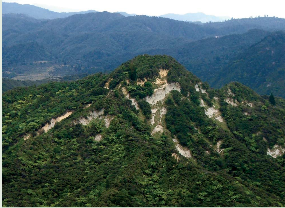
FIGURE 2 Hill-country erosion is a serious problem in the East Cape region, but reforestation can improve soil stability.

Māori landowners. At the outset, part of the project funding was allocated to purchase credits from the farmers for the first Kyoto commitment period at a uniform price of NZ$15 (US$ 11.25) per ton of CO 2 e.