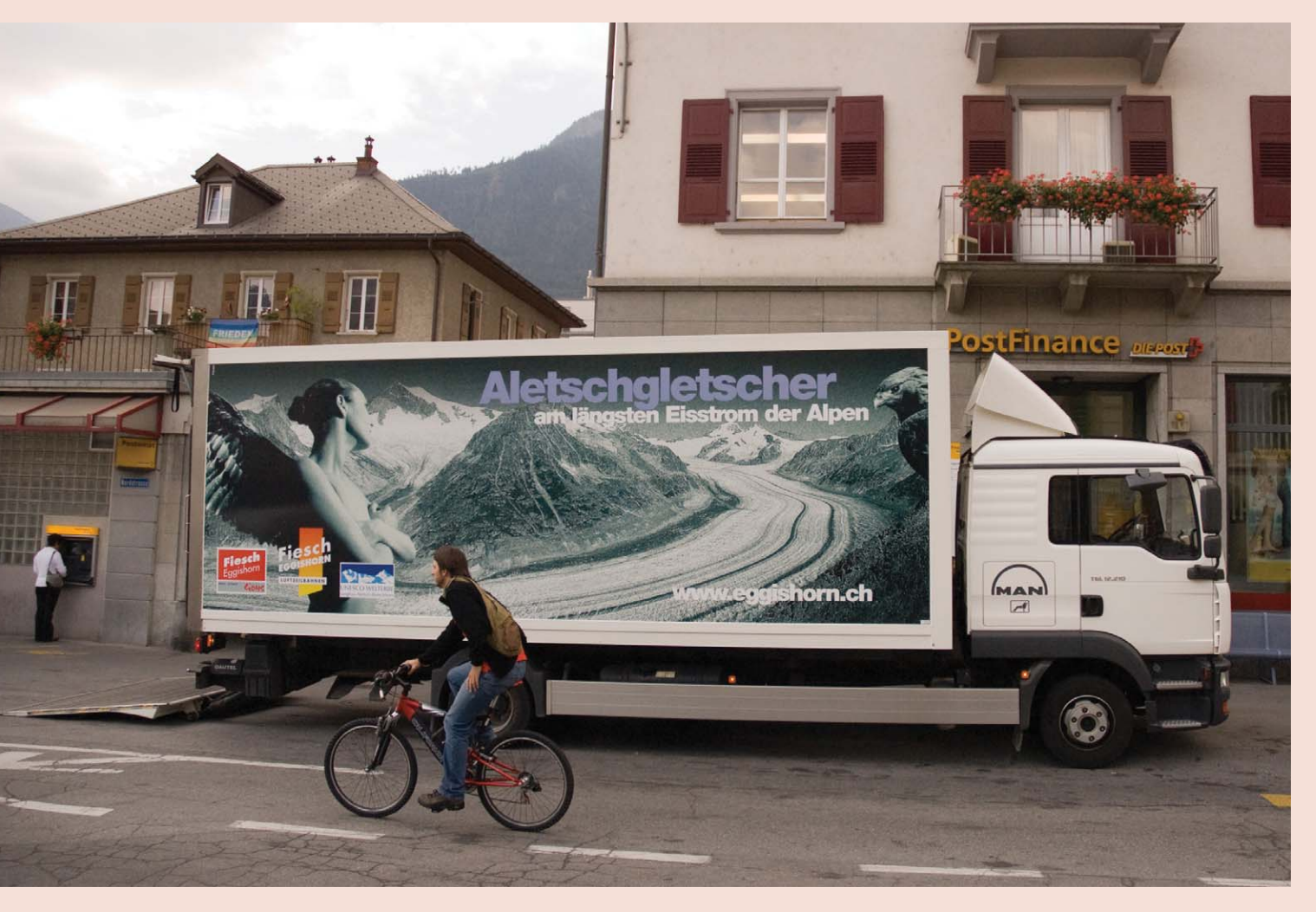
FIGURE 3 Landscape appropriation through intellectual property: the cable car company operating in the Commune of Fiesch uses the image of the Aletsch Glacier to maintain its market position.

means of landscape policies and regulation of strategies for landscape appropriation by public or private actors, clearly shows how complex and varied the sources of resource regulation are when considering landscape as a resource. Thus we can expect incoherencies.