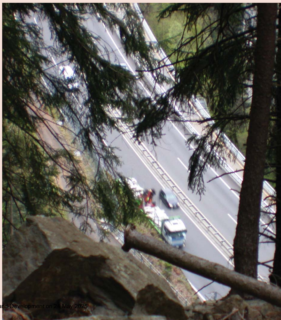
FIGURE 1 Rockfall threatens trans-Alpine transportation infrastructure.

not produced satisfactory results. It has been recognized that sectoral interventions cannot solve the forest vs game animal problem; uncertainty and disagreement continue to prevail about how to continue dealing with this problem. Faced with this challenge, representatives of a large number of regional and trans-regional interest groups started to meet. Amongst the most important in the Stotzigwald “action system” were landown-