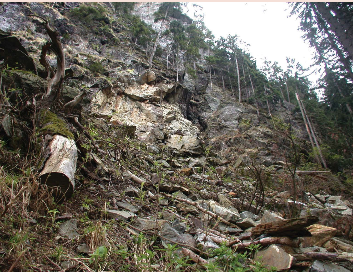
FIGURE 2 The protective function of the Stotzigwald ("very steep forest") is no longer assured: critical geological conditions and a lack of regrowth are destabilizing the forest system.

ers, farmers and forestry people, hunters and gamekeepers, conservationists, tourism operators, government offices at the local and cantonal levels, and researchers.