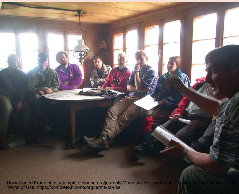
FIGURE 4 Stakeholders participating in the Stotzigwald Uri Platform discuss their joint development plan.