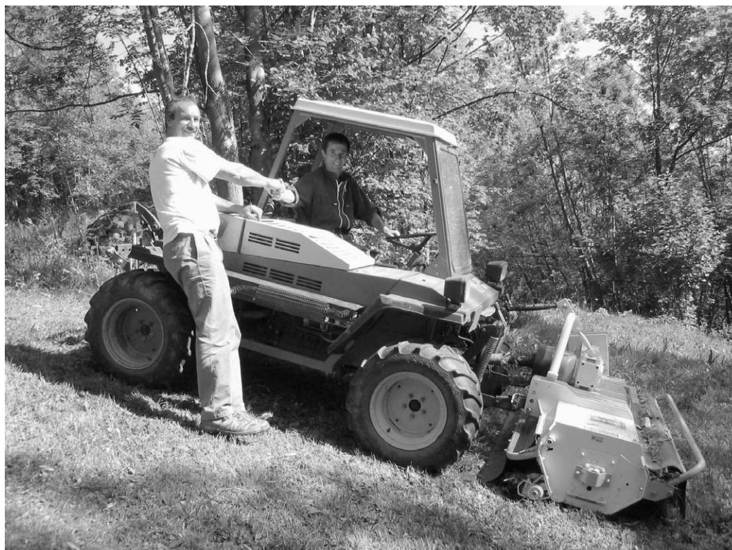
FIGURE 2 A services cooperative of farmers in Moyenne-Tarentaise, France.

identity of actors, the possibilities of interaction, and the margins of maneuver are negotiated and delimited (Callon 1986).