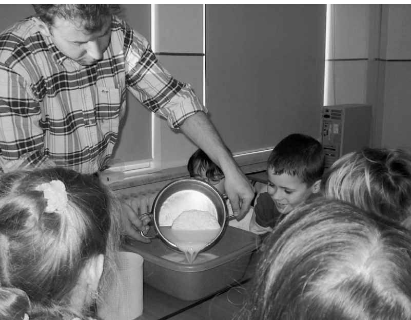
FIGURE 3 On-farm educational activities in Val di Sole, Italy: A farmer shows schoolchildren how cheese is made.

not only at the early stages when the group is defining objectives, but also later in the action implementation phase. There are a number of reasons for this. In the action implementation phase, concrete decision making modifies the problem, requiring new knowledge in that issues are taken into account that were initially ignored. Reformulation may also be related to changes within the local group and its network. Stakeholders from outside often initiate reformulation as they bring in new perspectives, new kinds of knowledge and networks. In Murau, for instance, the cooperative for wood energy changed its objective from selling wood chips to being a major actor of “Energy Vision 2015.” This project launched in the district of Murau in 2001 aims at achieving energy self-sufficiency for the whole district by the year 2015. Reformulation of the problem has gone hand in hand with a scaling-up of the group and a broadening of the partnerships forged at regional level.