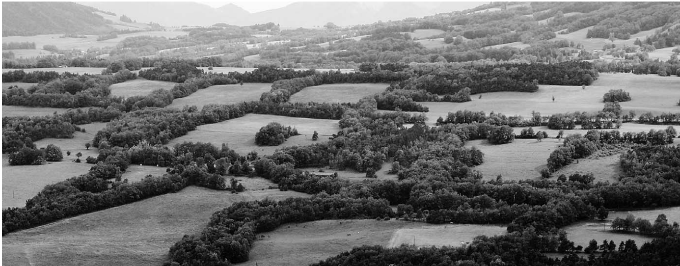
FIGURE 2 A well-structured landscape offers a habitat for a variety of species.

outset of the local and regional planning process (municipalities, regional authorities).