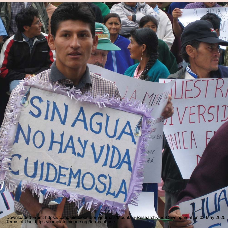
FIGURE 5 “Without water there is no life. Let’s take care of it.” Placard in Rio Blanco.

The primary objective of a water quantity study is to quantify potential effects of mine operations and facilities on surface water flow and flow from springs. Discharge should be measured continuously at the most important sites. A less expensive method for continuous measurements of discharge uses pressure transducers that are placed on the stream bottom. In both methods, a stage–discharge relationship needs to be developed for the specific locations using manual measurements of flow. Infiltration rates to the subsurface are estimated by collecting soil cores and testing them to learn how the soils in the study area store water and how water moves through them. Soil cores should be collected periodically from the tailings pile and the same measurements conducted to understand how much water may be infiltrating the tailings pile and flowing over the surface of the tailings pile.