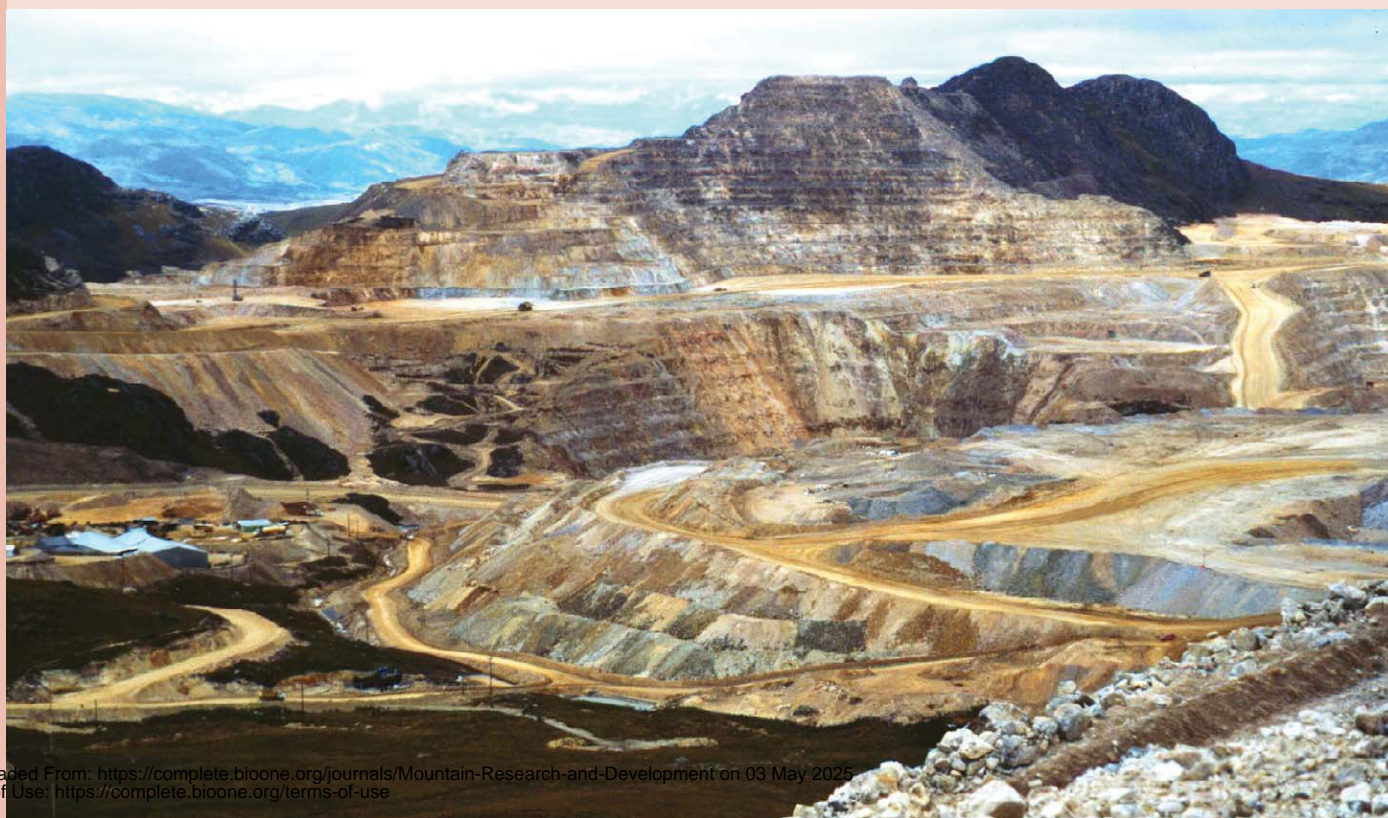
FIGURE 1 View of the Yanacocha open pit gold mine in northern Peru—the largest and probably most profitable in the world.

The delegation engaged with the mining company, national government, and a range of national, regional, and communi-