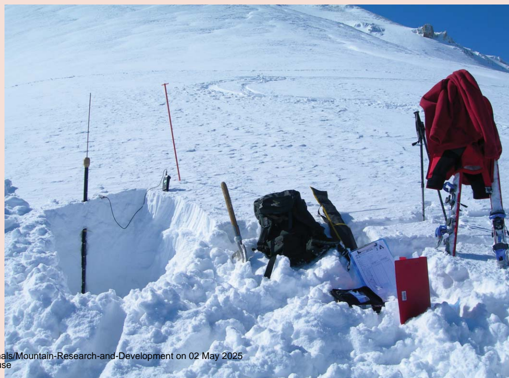
FIGURE 1 Sampling of snow layer for pH and electrical conductivity PROFILE determination in Prati di Tivo, Abruzzo, Italy.

Moreover, not only the quantity but also the quality of snow is changing. Looking deeply below and inside the white mantle, we are really surprised to find a rich content of particles, dust, and chemical/radiochemical compounds, with implications for the quality of meltwater and, consequently, for the health of people.