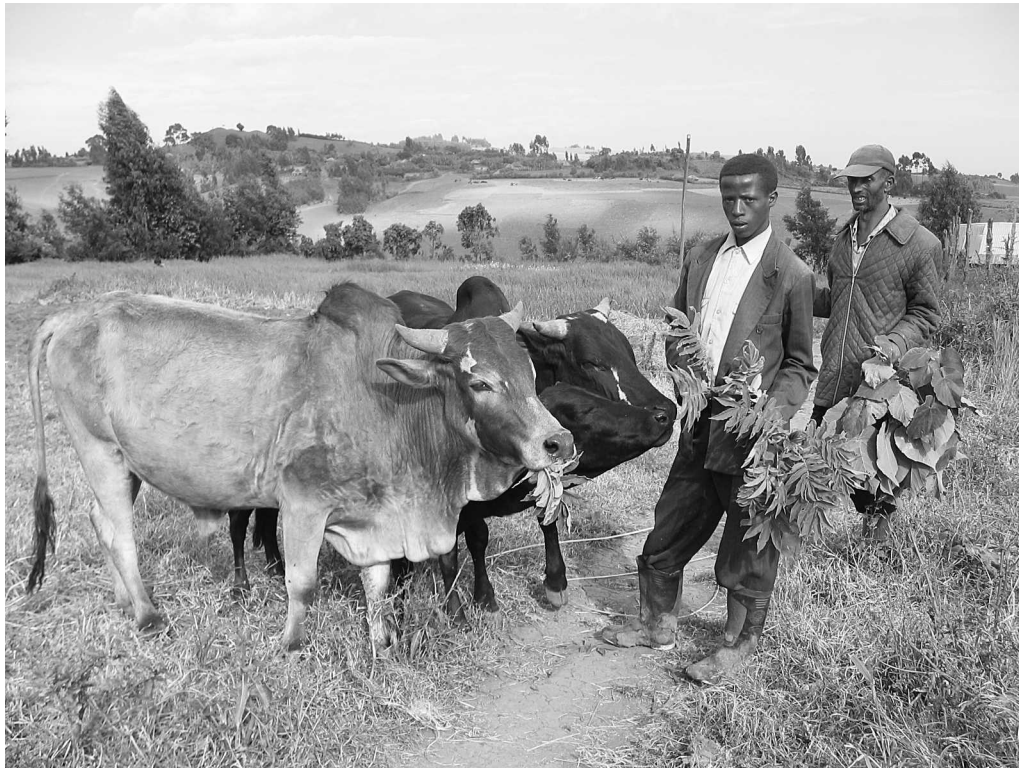
FIGURE 2 Farmers demonstrating the palatability of H. abyssinica and D. torrida at Galessa, central Ethiopia.

Ethiopia (Figure 1). The altitude ranges from 2900 to 3200 masl. The rainfall pattern is bimodal. The main rainy season is from July to September, and annual rainfall is 1399 mm. The soils are classified as Haplic Luvisols. The original vegetation in the area was mainly