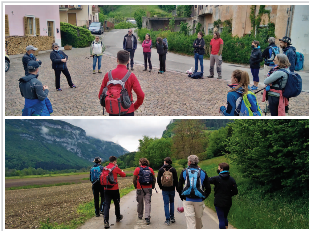
FIGURE 4 During the festival, convivial moments with the community and walks were functional to build relations with the communities and to explore collective resources and issues at stake.

Here, we briefly present the outputs of the different intervention phases and activities. The focus groups and surveys in each community were centered on identifying a variety of resources considered to be important for the community to take care of collectively; assessing how the values of these resources are changing; and envisioning their future and revitalization in the perspective of community development. Each focus group was carried out by dividing the participants into groups, each moderated by a core team member taking notes on a flipchart. Focus was placed on creating a group discussion to identify as many different resource values as possible, and to create a platform for communication among participants and discovery of these values and different interests. The reported resources and visions were interpreted according to the SESF categories (see Table S1, Supplemental material , https://doi.org/10.1659/mrd.2022.00013.1.S1 ). The resources identified in the focus