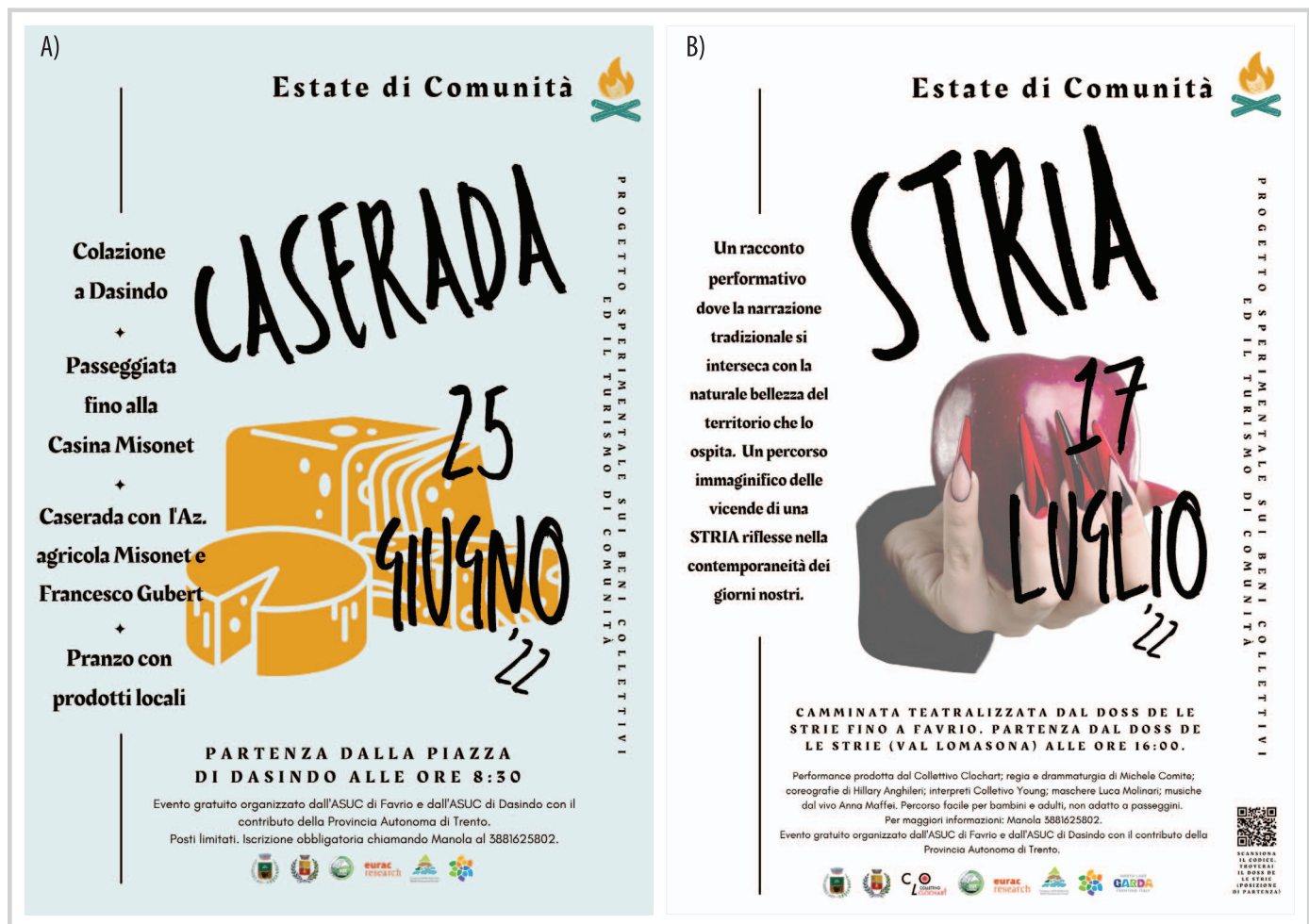
FIGURE 6 The first outputs of knowledge cocreation and intervention: advertising materials for the revitalization of collective resources through community-based tourism. (A) A poster advertising a collective cheese-making activity and lunch at the community hut. (B) A poster promoting a walking theater performance created by a theater collective with the participation of local communities and held in a space that symbolizes collective identity.

engagement of inhabitants toward care for the collective goods. Some conflicts (I4) were identified in the interviews. These relate to increasing land fragmentation and different interests within the community (eg clearing rewilded spaces versus keeping specific tree species), and to different models of agricultural production (eg intensive and industrial versus extensive and based on short value chains). The intervention assessed in this study represents a step in reconfiguring the organizational model in terms of opening the decision-making process to increase awareness and empowerment of the communities toward collective resource care. The intervention created the conditions for the elected delegates to have a discussion with community members and external local stakeholders about the future of the commons and its contribution to local sustainable development.