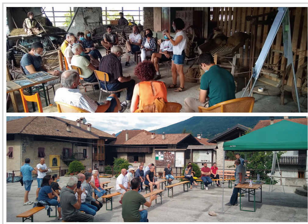
FIGURE 2 Intervention and research activities included focus group interviews in each community to identify collective resources, their changing values, and their future.

Note: CM, community members; ES, external local stakeholders.